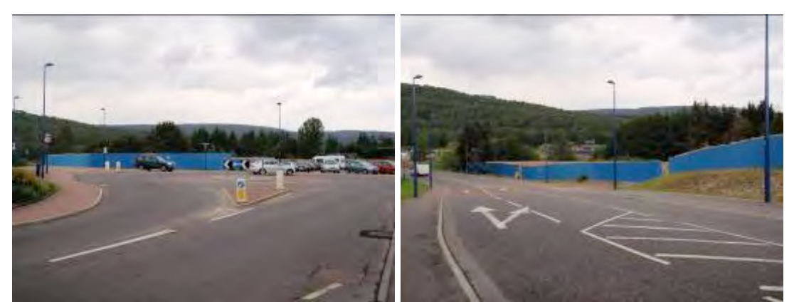
Fig. I- From Grampian Road