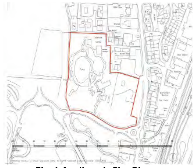
Fig. 6 Applicant's Site Plan