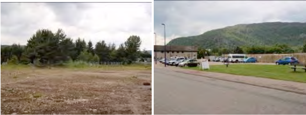
Fig. 4- Internal view of site

that in this type of application "the planning authority shall consider only the question of the conditions subject to which planning permission should be granted." Therefore, in the context of this application, the only matter which is required to be considered is the appropriateness and acceptability of varying condition I- extending the period over which development can commence.