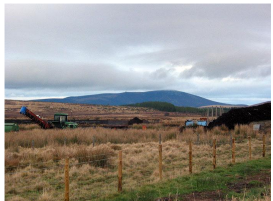
Machinery and stockpiles of excavated peat