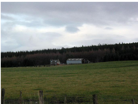
The farm of Inchnacape, set above a line of improved fields and back against woodland