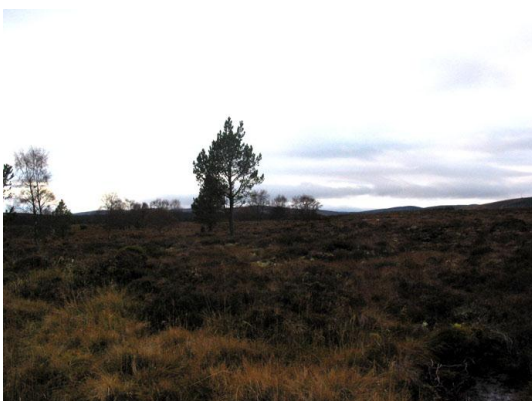
Regenerating pine and birch across the moorland to the north