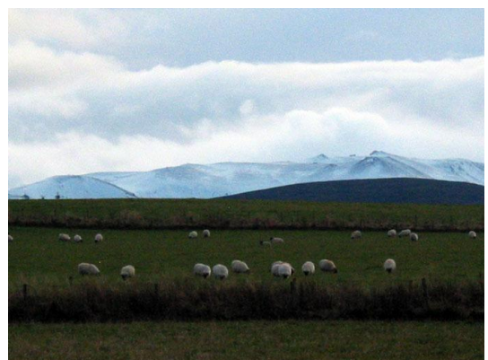
Views of the tops of high mountains appearing over the edge of this elevated valley