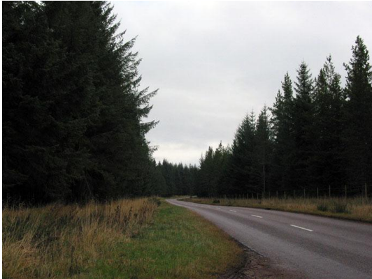
Conifer woodland on the lower slopes on the approach to the upper moorland of this area

The contrast between the enclosure of the woodland at the edges of the moor and the openness of the highest section of the moor reinforces the sense of elevation. The relative simplicity, and extent, of the mosaic of moorland vegetation reinforces the upland character.