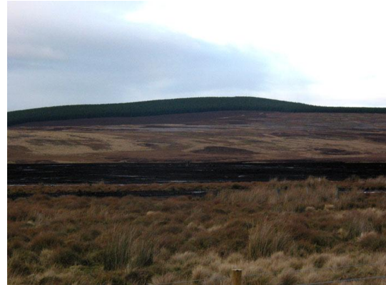
The open moor, with excavated peat in the middle distance