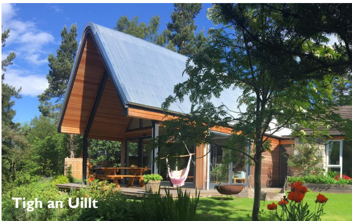
Tigh an Uillt

The overall winner was a new build property – Strathdon House – by Brown + Brown Architects. The judges favoured Strathdon House because of its compelling, simple design. They also described the overall runner-up, an extension to the residential property Tigh an Uillt, as a ‘lovingly created elegant space’.