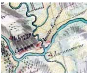
Roy's Military Survey c1750