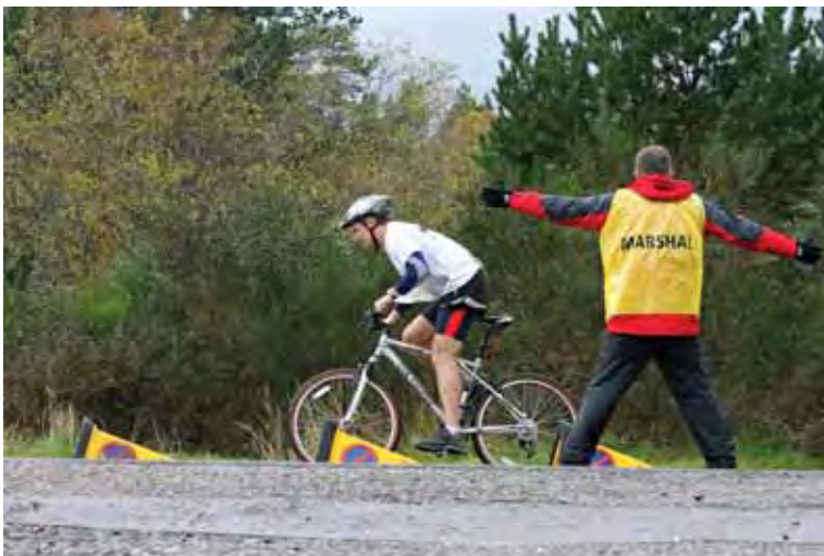
Left: The Cairngorm Charmer

It is good practice to survey participants and all interested parties, eg local residents, agencies and neighbouring land managers, after the restoration work is complete but soon enough so that everyone remembers the main elements of the day. Event organisers may wish to consider keeping a written note of issues throughout the process of planning to the actual day of the event so that these can be included. For larger events a meeting may help draw out what has been learnt from the staging of the event which will help in the future. A short report should be produced and circulated to all interested parties. It would be of great help and assistance if organisers sent a copy of all event reports to the CNPA for retention, email: outdooraccess@cairngorms.co.uk . These reports can then be consulted by future event organisers.