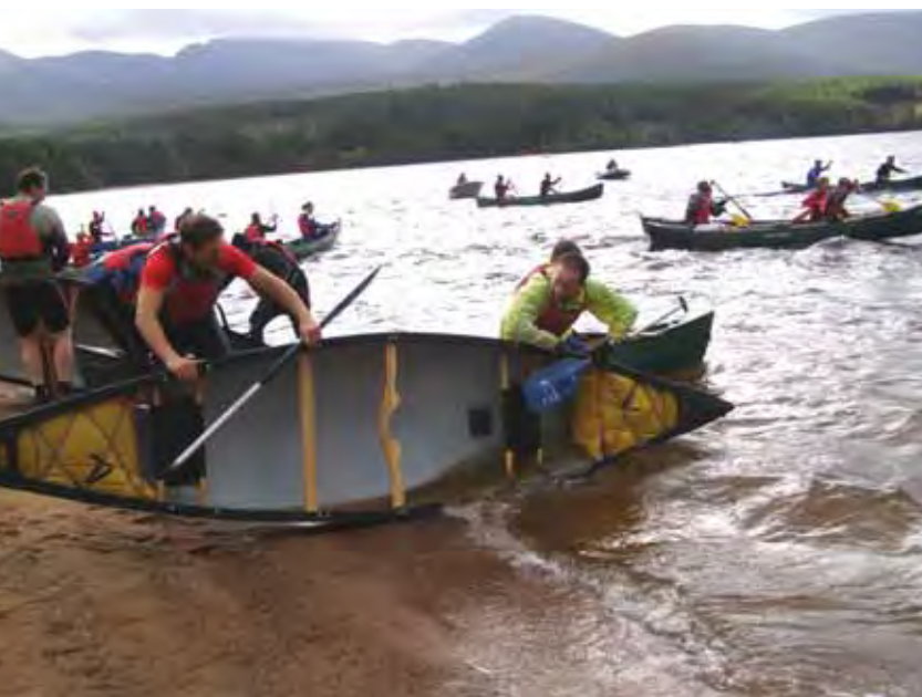
Left: Cairngorm Adventure Triathlon

Equally, the Cairngorms National Park has areas that are well suited to holding spectacular and successful outdoor events that can bring participants and spectators closer to this wonderful environment. If well planned and managed, events need not conflict with the environment, residents, other users, or land managers.