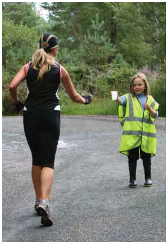
Left: Race marshalling, Nethy Bridge

such sites. The CNPA can also provide information and advice on how to avoid causing damage to other sensitive habitats. On SSSIs, land managers must obtain consent from SNH to carry out or permit certain operations – known as ‘operations requiring consent’ – that might damage the features of the site, and if the site is also a Natura site a further assessment may be required. It is therefore important that land managers are consulted in good time to allow them, if necessary, to discuss the issues involved with SNH.