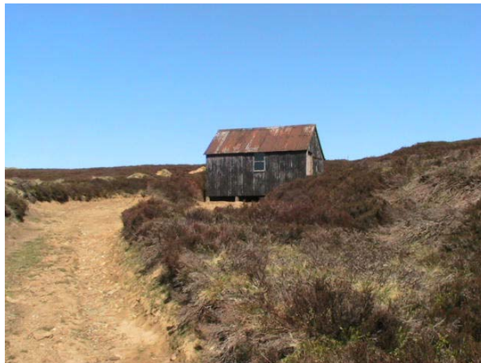
Fig. 3: Photo taken in a northern direction showing the Lunch Hut and the existing track.