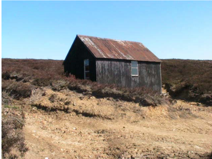
Fig. 2: Photo taken in a north east direction showing the depth at which the structure is burrowed into the hill and the existing track.