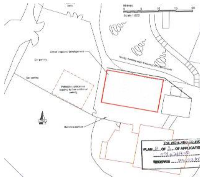
Fig. 5 : Proposed site layout plan