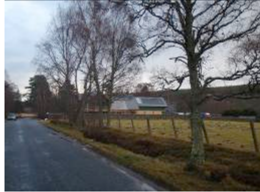
Fig.3-view of new house from south