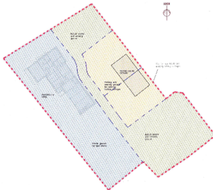
Fig.5 - Plan showing proposed amenity ground for new house/cottages