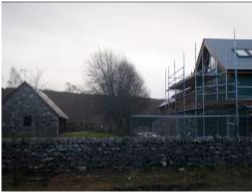
Fig.2 cottages left new build right