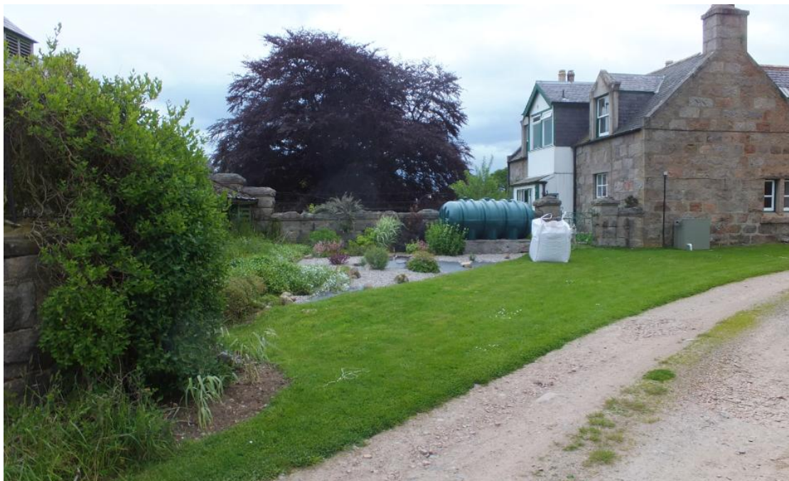
Photo 1 Site Viewed from the Track