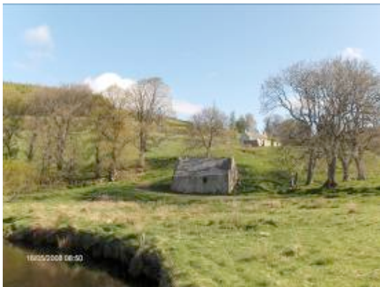
Fig. 4 site of turbine house to right of old mill building, Don and site of out fall in foreground