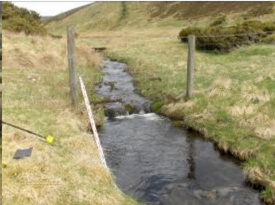
Fig. 3 Burn at site of intake weir