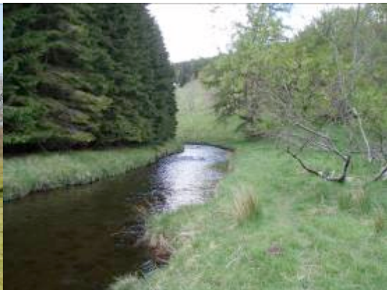
Fig. 5 Don looking upstream from out fall site