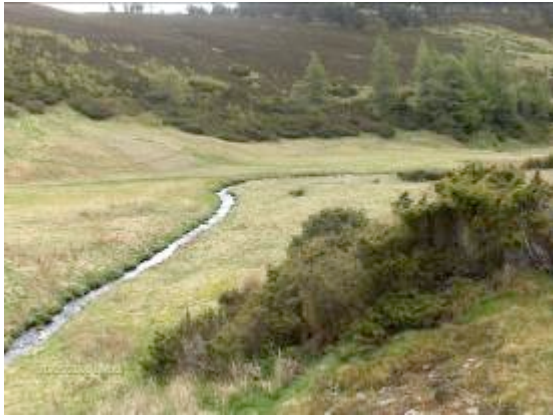
Fig. 2 Burn and valley section below intake weir