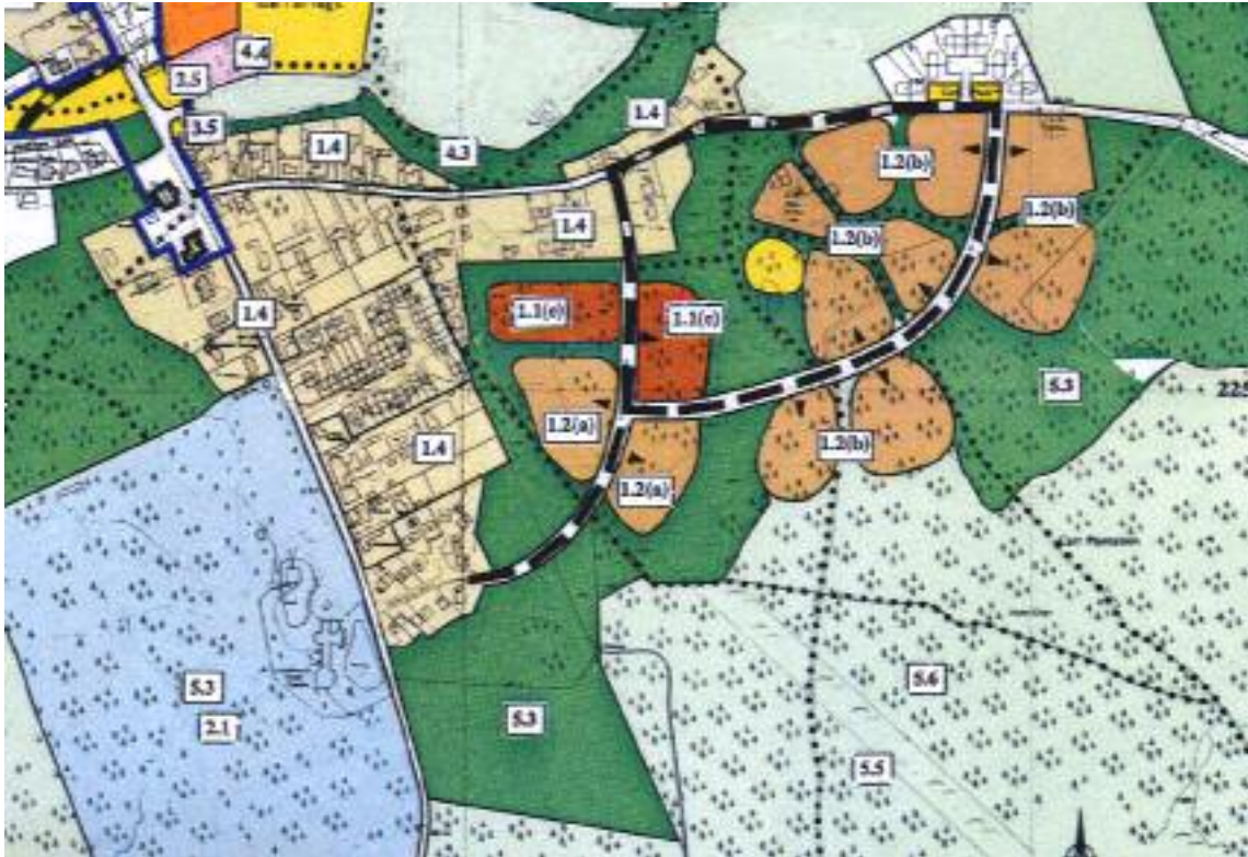
Fig. 2 - Carrbridge proposals map from Badenoch & Strathspey Local Plan (the dark & light brown zones (1.1e, 1.2a & 1.2b) were zoned for new and long-term housing respectively. Yellow is recreation/open space.)

‘affordable-housing’ section of 28 plots is cast beyond the village perimeter (into what was zoned as ‘amenity woodland’). There would also be concern at a future stage that the 89 houses for sale are not all of identical design, and that reference is made to the cultural heritage of the area.