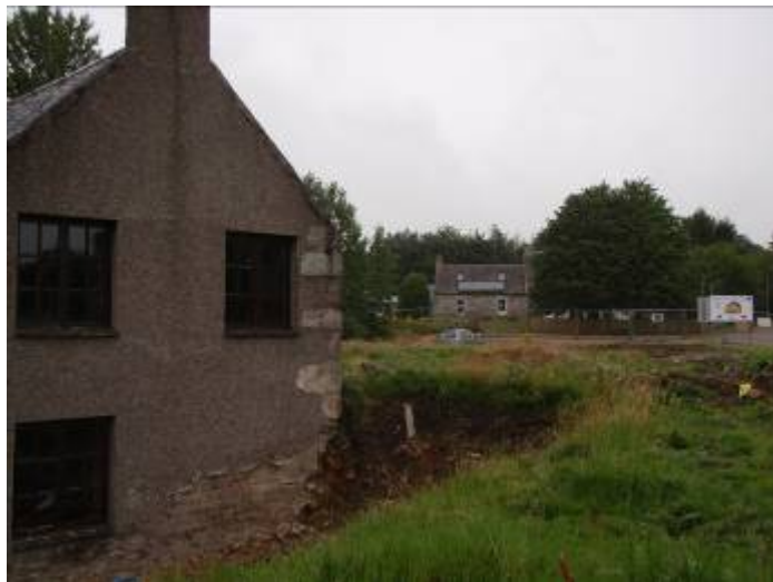
Fig. 4 - South elevation with Balnagowan farmhouse in background