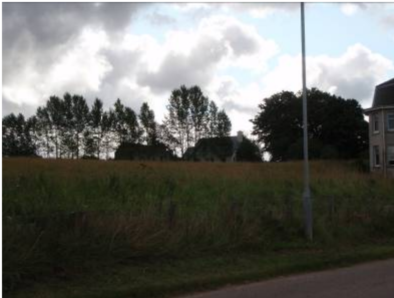
Fig. 6 - Balnagowan steading and the adjacent new house viewed across the open amenity land from Grantown Road