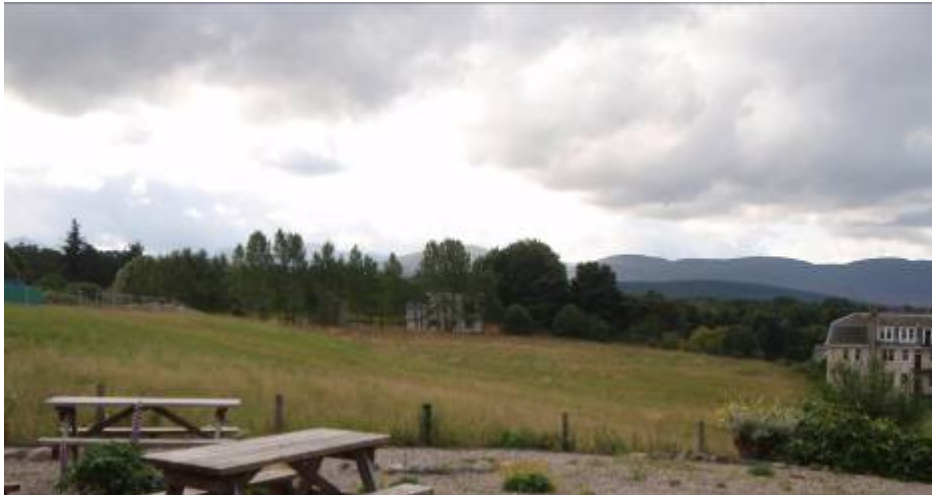
Fig. 5 - Looking South from Mountview Hotel, across the amenity open space. Balnagowan steading and the adjacent new house in the middle distance.