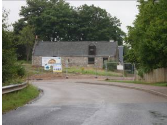
Fig. 2 - Balnagowan Steading looking West from Balnagowan Brae