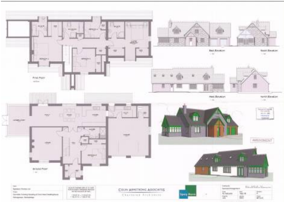
Fig. 9 - Elevations and Plans