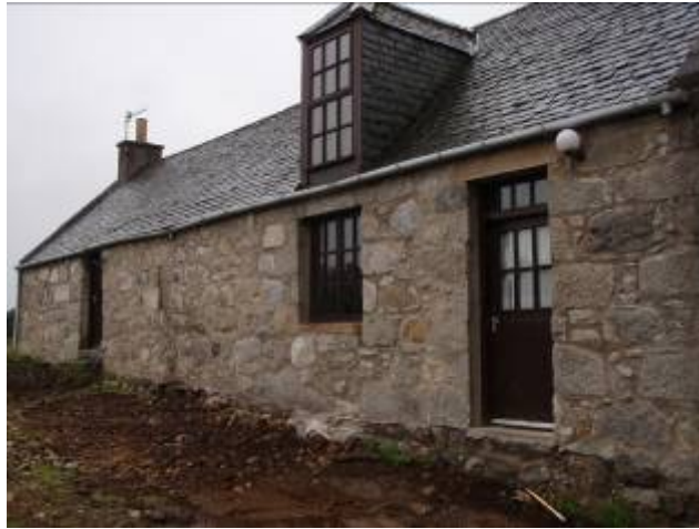
Fig. 3 - East Elevation