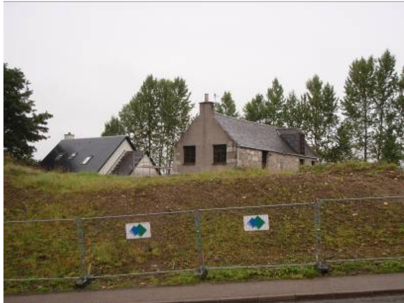
Fig. 7 - Balnagowan steading viewed from the amenity area on Balnagowan Brae