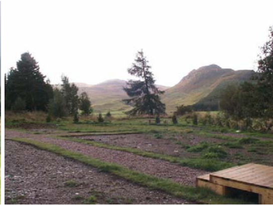
Fig 3. site from hotel garden