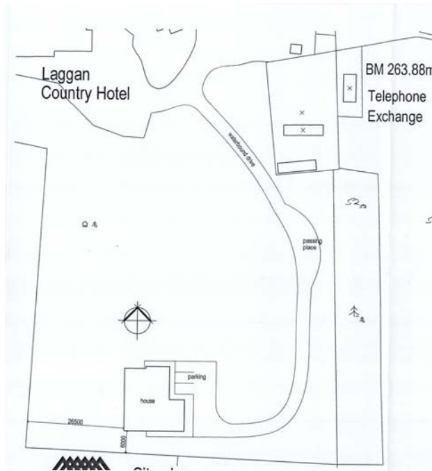
Fig 4. amended site layout plan