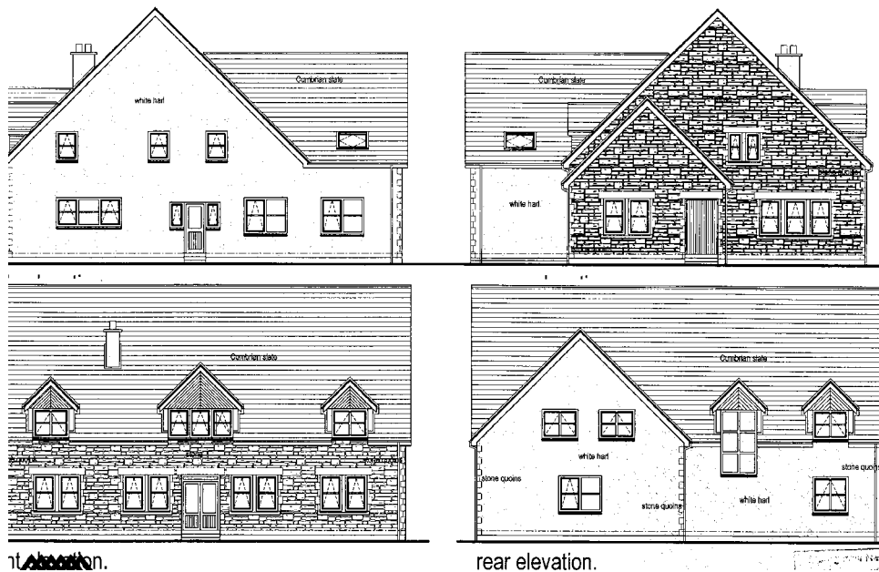
Fig 6. amended elevations