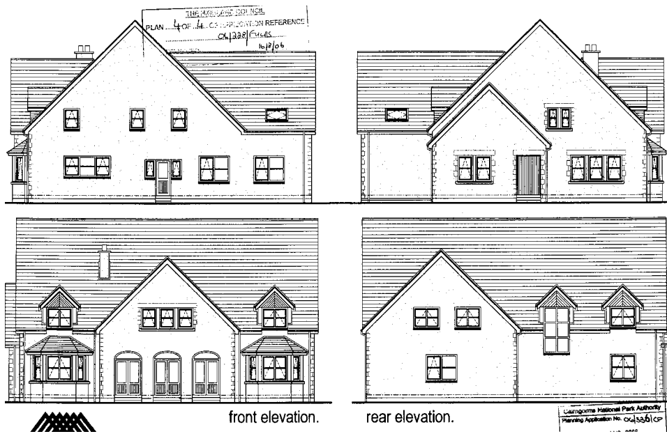
Fig 5. original elevations