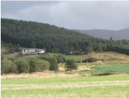
Fig 2. looking to site across strath