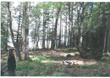
Proposed powerhouse location