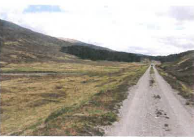
Existing track to be upgraded