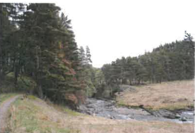
Location of proposed dam