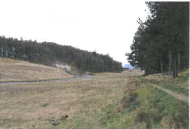
View of proposed reservoir area