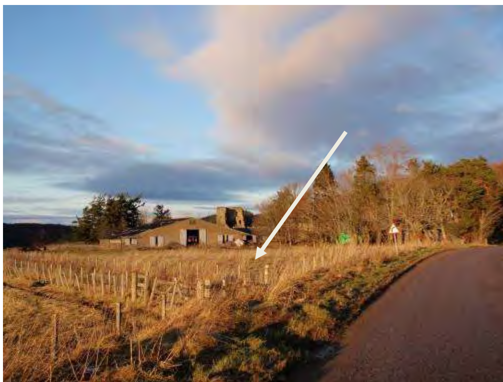
Fig. 2- Site from B 9136 (Drumin Castle behind)