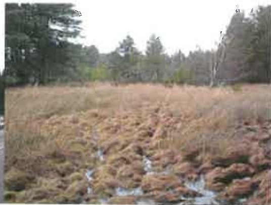
Fig 3 Looking NE to bog woodland