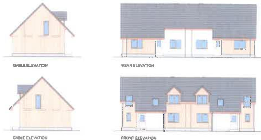
Fig 7 Semi-detached affordable housing (phase 1)