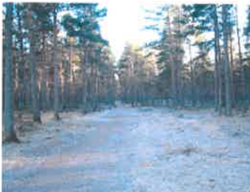
Fig 4 Sustrans Cycle Route