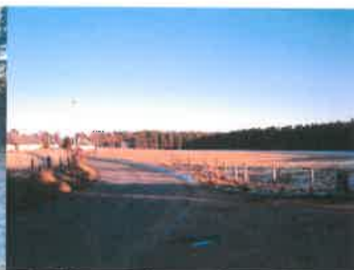
Fig 5 Area adjacent Carr Road