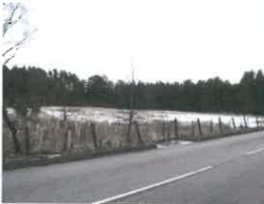
Fig 2 site entrance from B9153