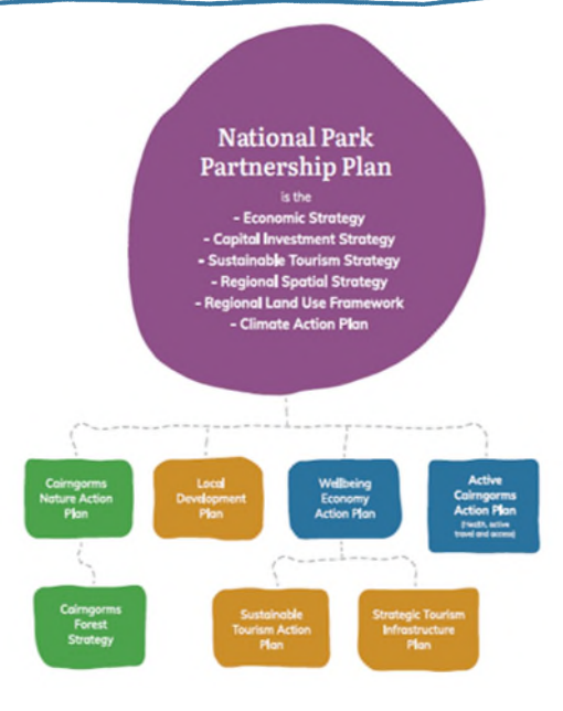
Figure 1- Hierarchy of Plans

The proposed aim for the Active Cairngorms Action Plan is: