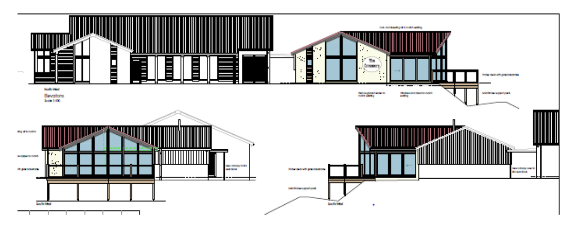
Figure 2 – Proposed Elevations

shown in Figure 2 . Proposed finishes are wet harled walls, corrugated roof sheeting and timber detailing, all to match existing with timber deck area on timber supports.