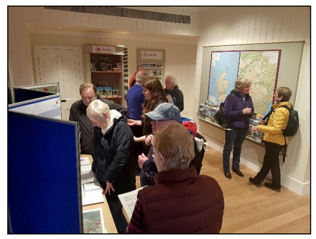
Ballater Consultation event (Feb 2019)