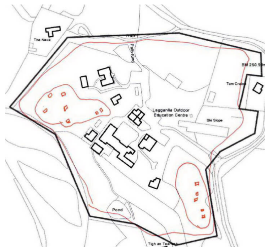
Fig. 2 – Various hut locations around Centre