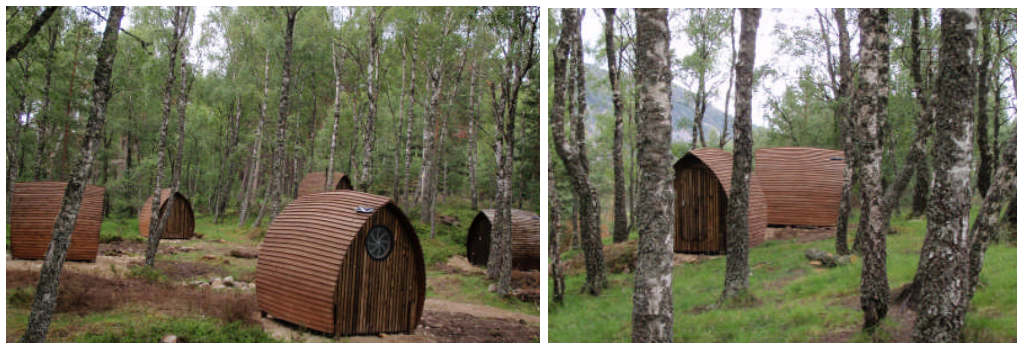
Fig. 3 & 4 – Wooden Hut photos showing woodland location Background