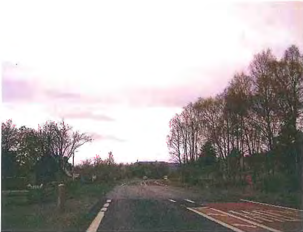
View of existing access from position 185 metres east on westbound approach

08/00059/FULBS: North of Birch Cottage, Drumuillie, Boat of Garten, A95