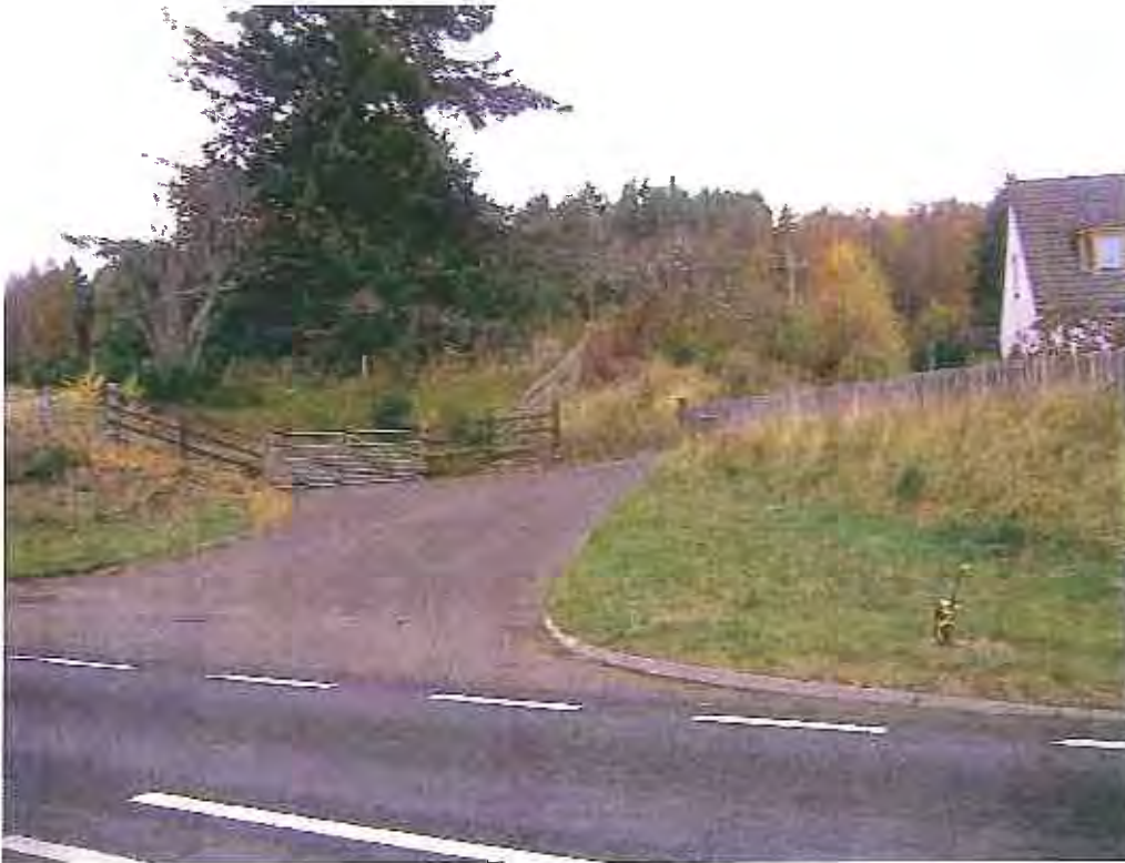
View of existing access from position southeast looking northwest

08/00059/FULBS: North of Birch Cottage, Drumuillie, Boat of Garten, A95