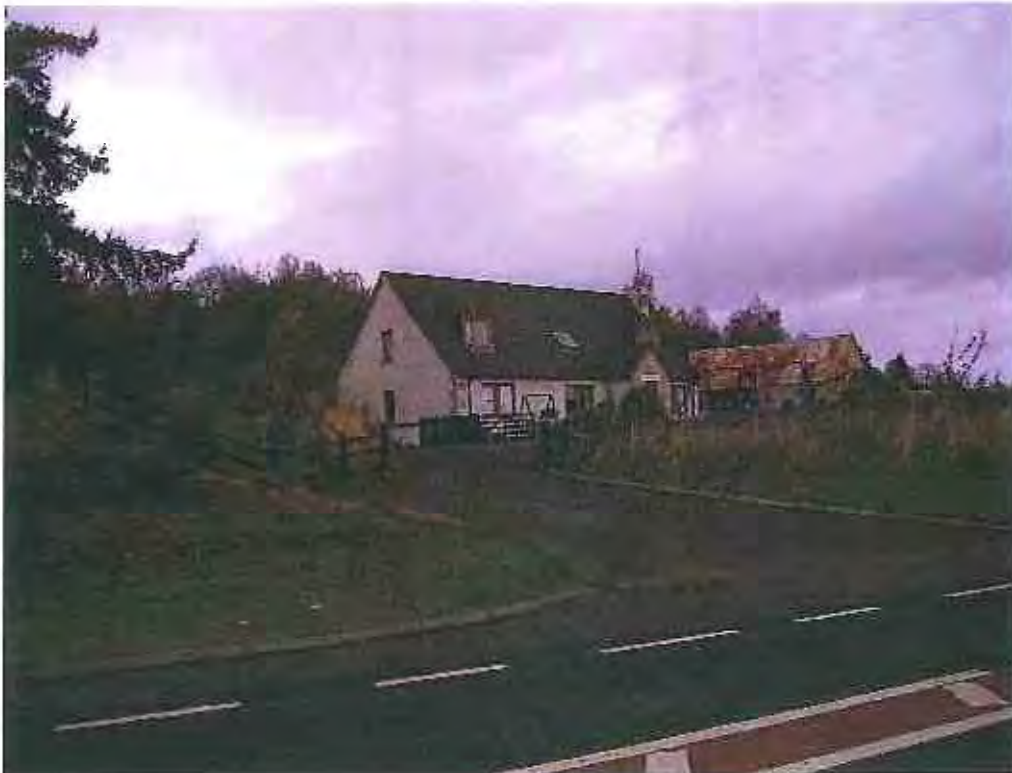
View of existing access from position southwest looking northeast

08/00059/FULBS: North of Birch Cottage, Drumuillie, Boat of Garten, A95