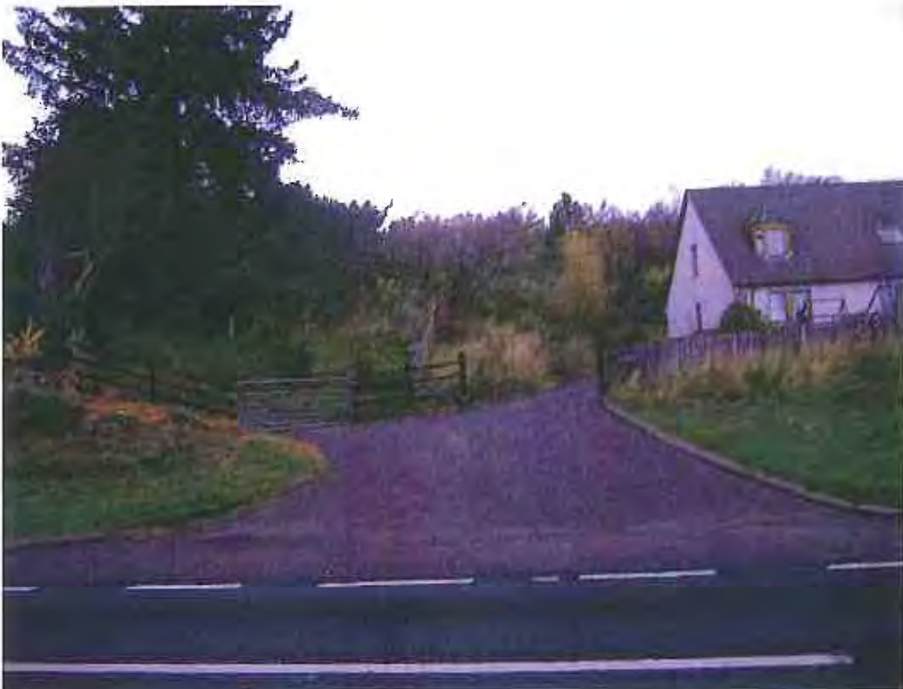
View of existing access from position south looking north