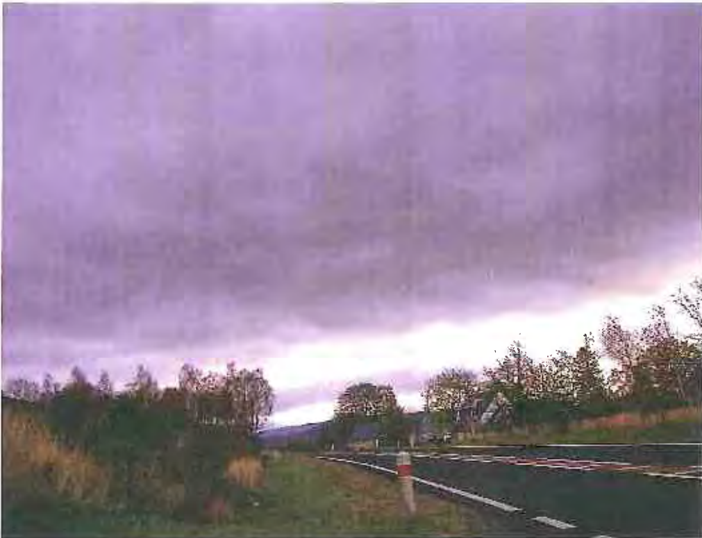
Visibility from existing access looking east at 2.4 metres setback

08/00059/FULBS: North of Birch Cottage, Drumuillie, Boat of Garten, A95