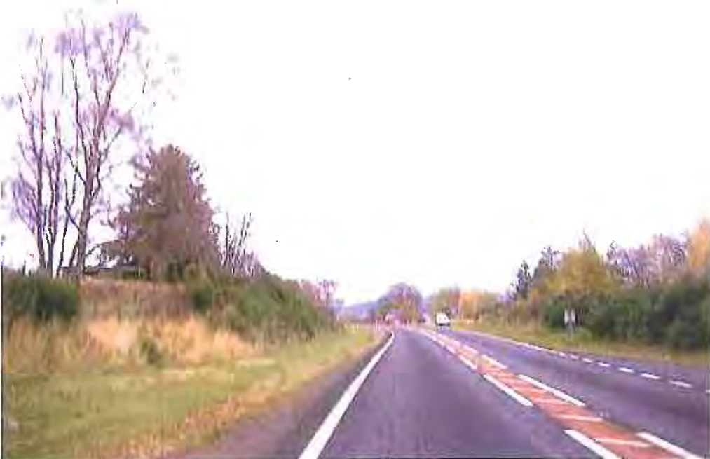
View of existing access from position 100 metres west on eastbound approach