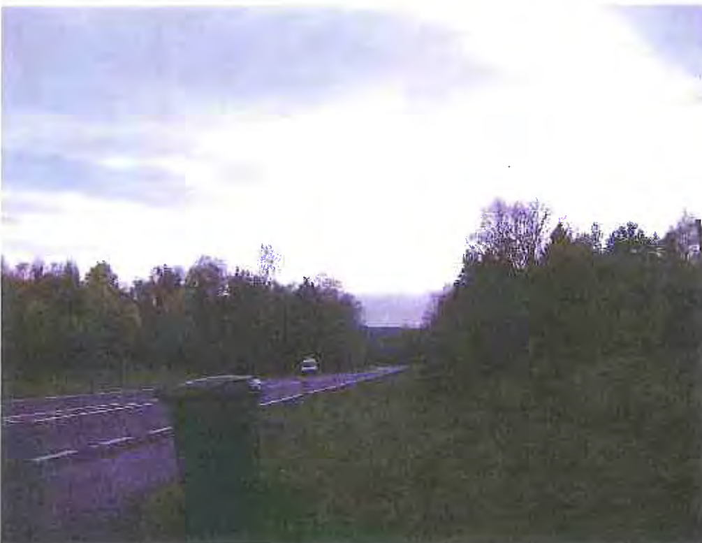
Visibility from existing access looking west at 4.5 metres setback