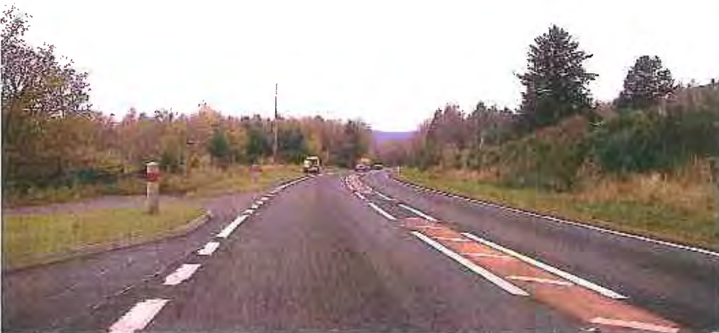
View of existing access from position 100 metres east on westbound approach