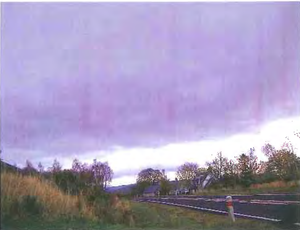
Visibility from existing access looking east at 4.5 metres setback