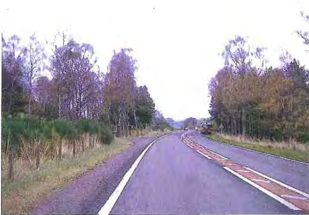
View of existing access from position 215 metres west on eastbound approach

08/00059/FULBS: North of Birch Cottage, Drumuillie, Boat of Garten, A95