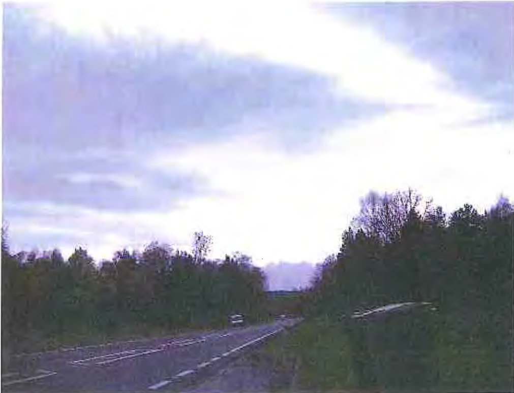
Visibility from existing access looking west at 2.4 metres setback

08/00059/FULBS: North of Birch Cottage, Drumuillie, Boat of Garten, A95