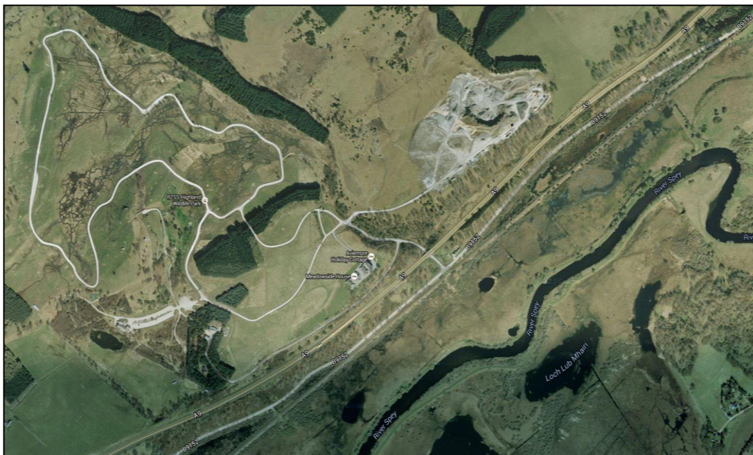
Figure 2 - Quarry location and surrounds.