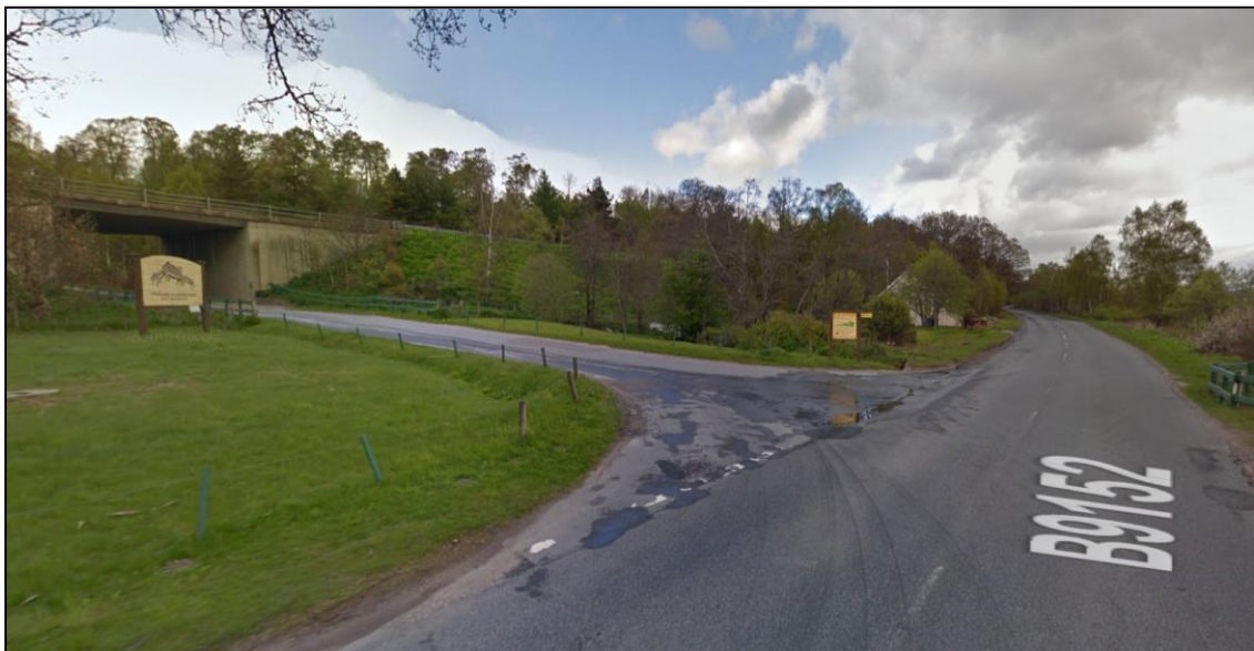
Figure 3 – Current shared access with Meadowside House and Wildlife Park from the B9152