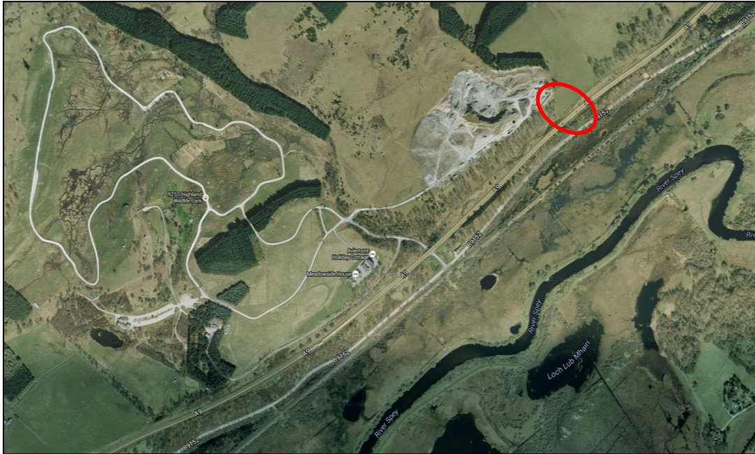
Figure 5 – location of proposed alternative access