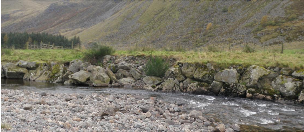
Figure 3 : Photograph illustrating one of the locations of the proposed bank works between Acharn and Braedownie