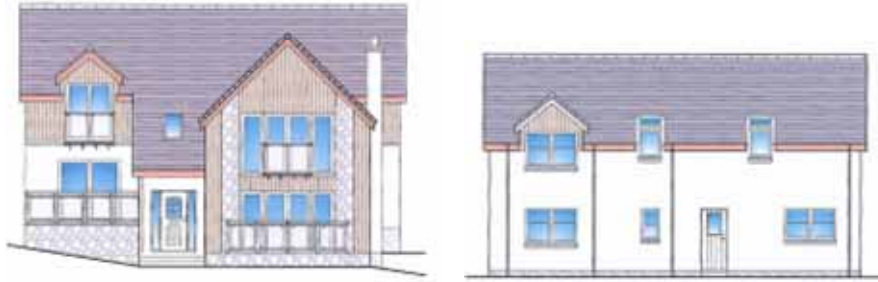
Figure4: House type J – revised front and rear elevations