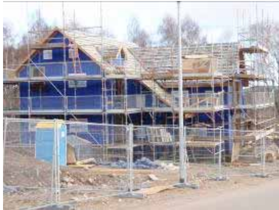
Figure 2: Ongoing construction work – Lochnagar house type