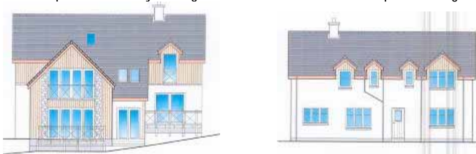
Figure3: House type J – previous front and rear elevations