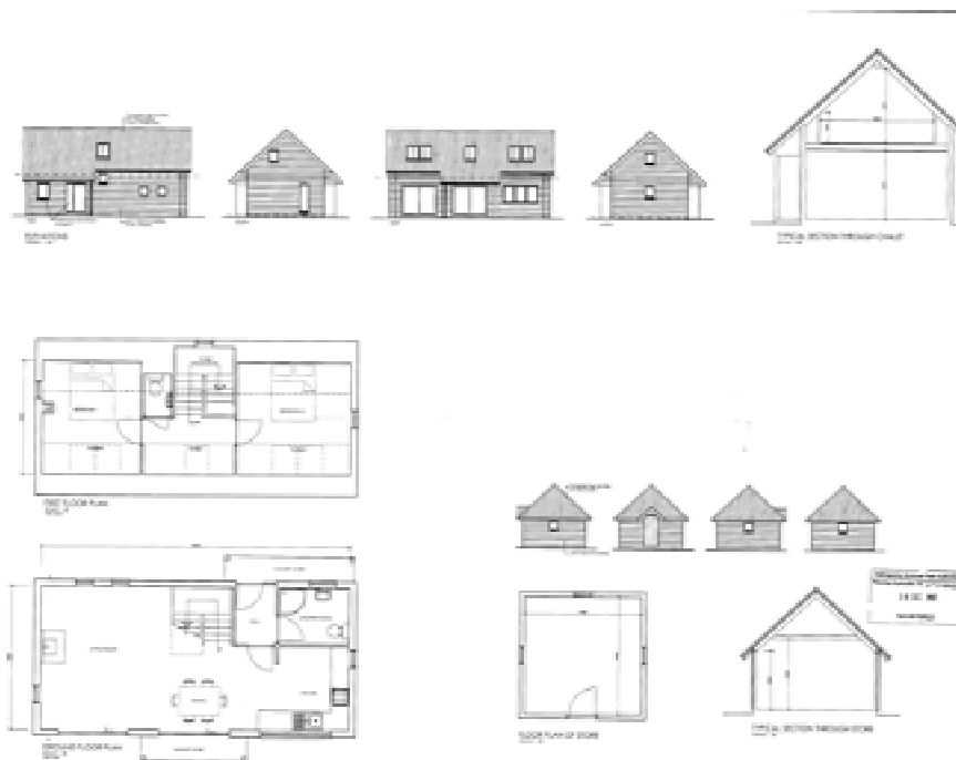
Fig 4 Elevations and plans for chalet and outbuilding