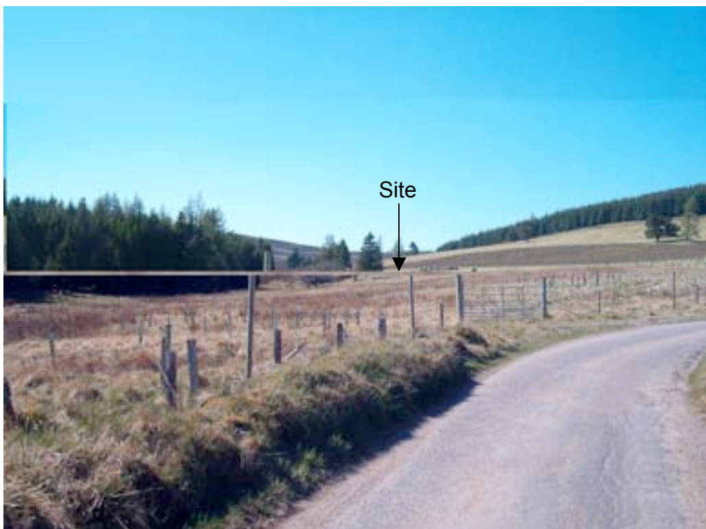
Fig 2 View towards site showing access through gate from public road