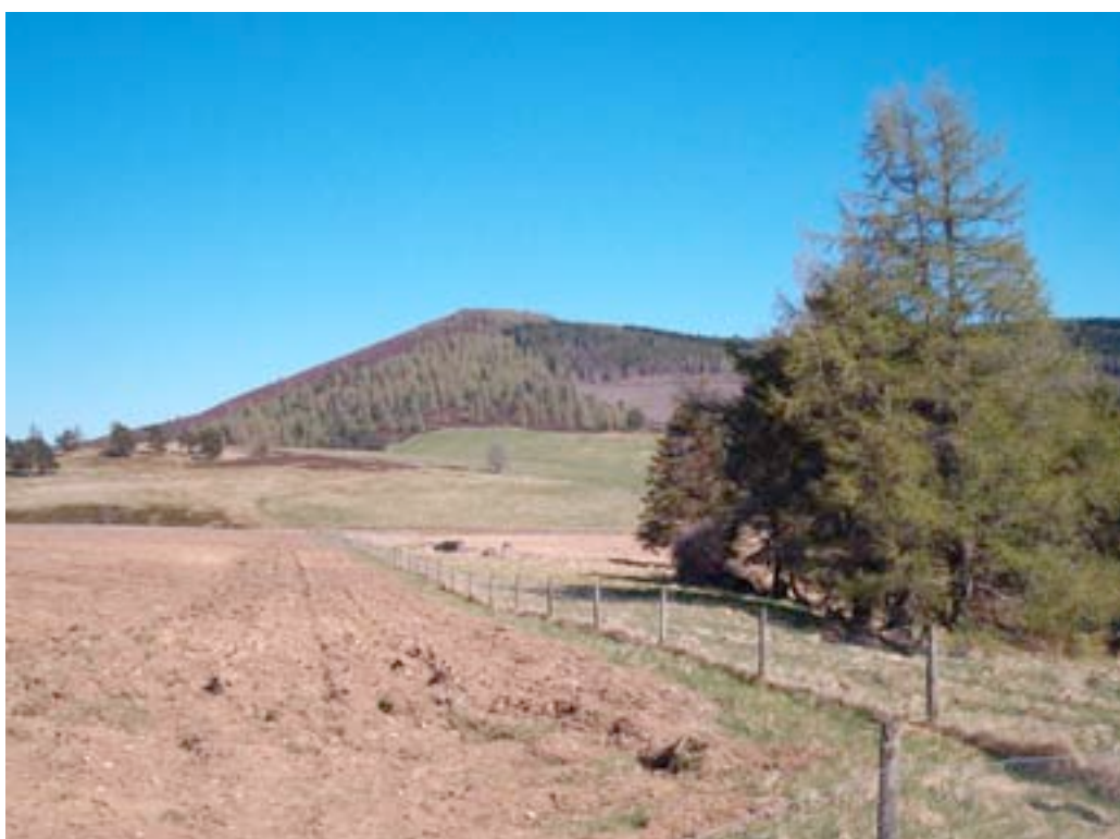
Fig 3 View of site (between ruin and trees) looking towards public road