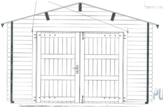
Garage front elevation