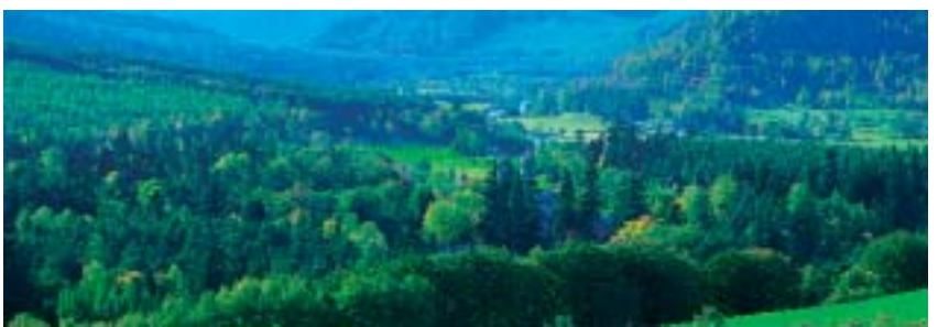
Deeside

The Scottish National Parks, unlike others in the UK and around the world, have a social and economic development aim alongside their more standard aims of conservation, understanding and enjoyment of the countryside. Tourism is a vital part of this social and economic development, and at the same time also helps to deliver each of the aims in the Park's remit.