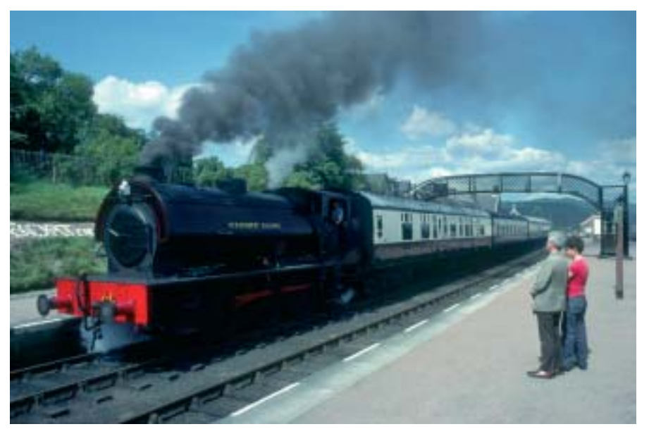
Strathspey Steam Railway