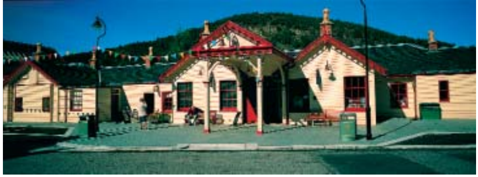
Ballater, Visitscotland Aberdeen & Grampian