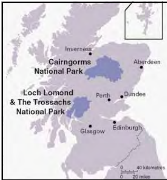
SCOTLAND'S NATIONAL PARKS

Finally the Pack provides a space for you to keep information that will be of use in the future. For example, this might include information from the Park Authorities and SNH (you can get these by requesting updates and mailings – see the 'Contacts and Information' section of this Pack).