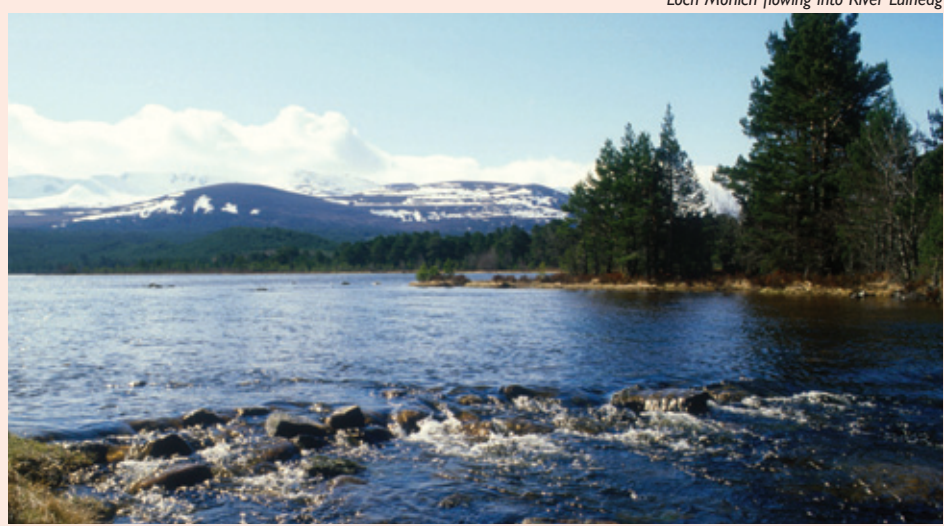
Loch Morlich flowing into River Luineag

This service is operated by Rapsons, see page 8 for contact details.