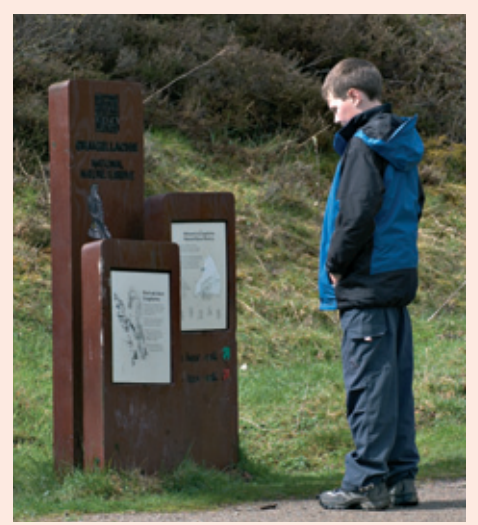
Craigellachie Nature Reserve

viemore is on the main train line and A9 bus routes, see pages 20. 23. 34-35. It has all sorts of accommodation from large resort hotels to hostels. There is a post office, supermarket, chemist, and various other local retailers. Take a free tour around Cairngorm Brewery (phone first on 01479 812222), or follow one of the signposted walks from the centre. From Aviemore, you can take the bus into the smaller surrounding villages like Boat of Garten and Nethy Bridge (pages 20, 24-27). For an easy taste of the hills go up to CairnGorm Mountain and ride on its mountain funicular railway, pages 24-27. See www.cairngormmountain.org.uk for a Webcam and more info.