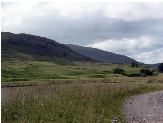
Fields and pasture on better drained deposits the abandoned farm at Craigmackie sits on these slopes