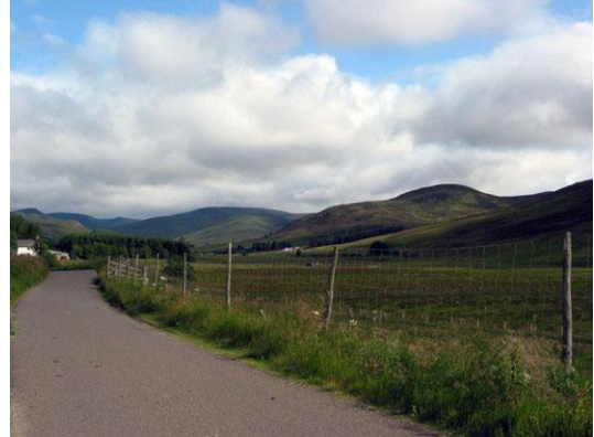
Gentle side slopes, especially those facing west