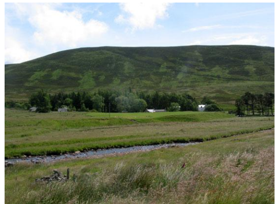
Settlement and shelter woods associated with the well drained alluvial fan and watercourses