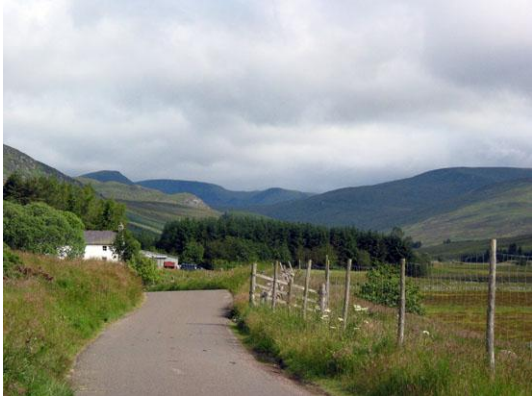
Buildings sheltered by woodlands at the end of the narrow public road

relationship between the settlement, farmland and the well-drained deposits at the convergence of the two main watercourses.