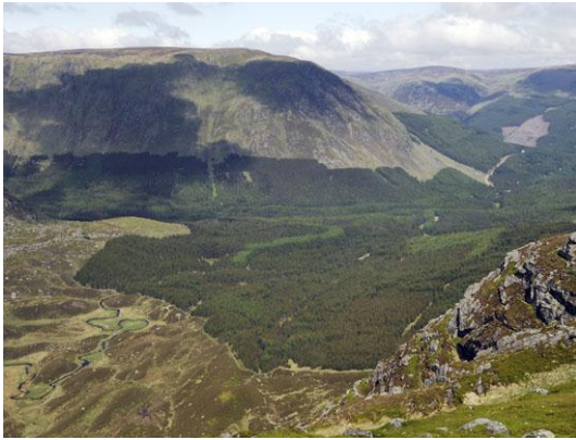
Conifer woodland fills much of the floor of this glen, extending up to the base of the rocky cliffs

The drama of the sheerness of the side slopes and the height of the hills forms a very pronounced sense of enclosure and reinforces the sense of 'high pass' when walking or cycling up and down this glen. The rocky overhangs, corries and massive outcrops of rock reinforce the ruggedness of the upper slopes and mountain tops.