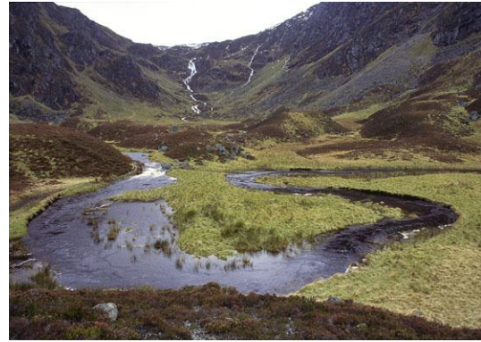
The dramatic Corrie Fee with massive rock outcrops