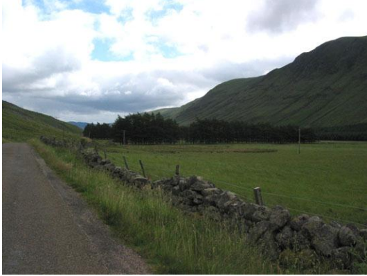
Extensive woodland and grassland fields across the flood plain

The 'linearity' of the glen is very pronounced, reinforced by the evenly graded side slopes, and relatively level ridgelines, creating long, well-framed views. The rock falls, which include huge boulders, are a dramatic feature. There is a strong, historic link between evenly spaced farmsteads and the break in slope.