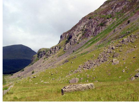
The steep side slopes are frequently covered by extensive, dramatic bouldery rock falls