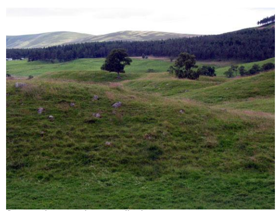
Distinct hummocky, gravelly deposits