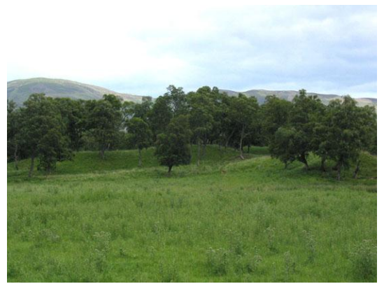
Possible remnant wood pasture on hummocks of glacialfluvial deposit