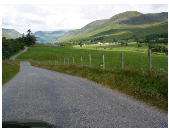
The road follows the ups and downs of the underlying terrain

The interlocking low hummocks of well-drained glacial deposit across the glen floor is very apparent and often reinforced by the presence of open birch woodland on the knolls. There is a clear pattern of dispersed settlement, tucked into the hummocky terrain at the edge of the floor of the glen.