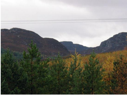
The craggy, exposed rock of these hills, with forestry in the foreground

These small but rugged hills of craggy, exposed rock, form an irregular skyline which is easily recognisable when visible, but the area is secluded and rarely visited, largely tucked away behind surrounding woodland.