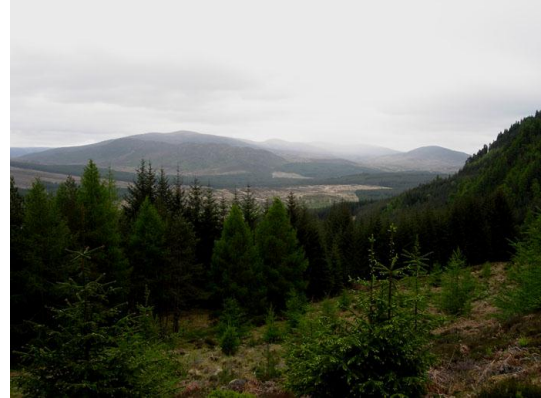
Woodland along the lower slopes, with the Ardverikie hills in the mist