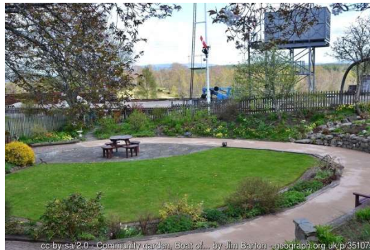
Figure 13 –community garden at Boat of Garten, identified during community consultation as a feature of local importance

An understanding of past ways of life, housing and culture can help identify what features may be of local or wider importance. Information provided by the Park Authority and the Highland Folk Museum is available via https://cairngorms.co.uk/caring-future/cairngorms-landscapes/cairngorms-special-landscape-qualities/special-landscape-qualities-culture-history/ and https://www.highlifehighland.com/highlandfolkmuseum/collections/ .