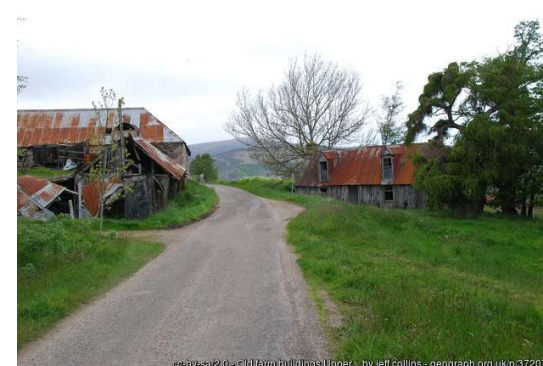
Figure 12 – BARR listed derelict farm at Upper Tullochgrue, near Aviemore

threat, usually (but not always, figure 12) a listed or unlisted building within a conservation area. BARR does not include all buildings at risk, just those that have been reported to or identified by Historic Environment Scotland.