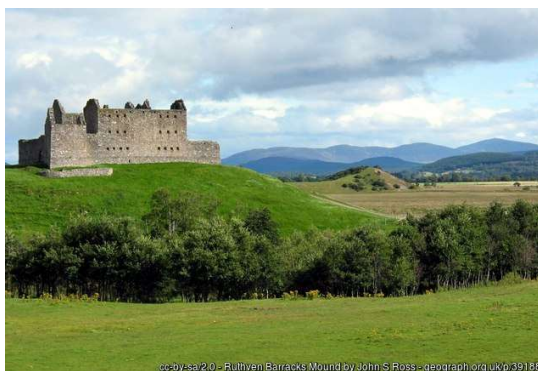
Figure 5 – the Ruthven Barracks scheduled monument and setting, near Kingussie

There are 110 nationally important sites, buildings and other man-made features (figure 5) in the Park given legal protection under the Ancient Monuments and Archaeological Areas Act 1979.