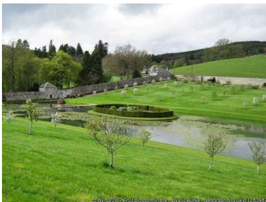
Figure 10 – Hercules garden near Blair Atholl, a B listed walled garden also on the Inventory Gardens and Designed Landscapes