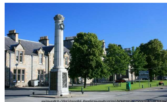
Figure 6 – tree lined and lawned centre of Grantown on Spey conservation area, and category B listed war memorial

Information about the Grantown on Spey conservation area (figure 6) can be found via: https://www.highland.gov.uk/info/192/planning-and-building-listed-buildings-and-conservation-areas/167/conservation-areas/2 .