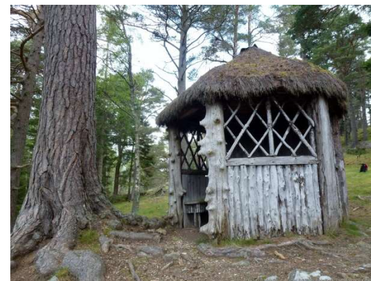
Figure 8 – category C listed summerhouse within Invercauld garden and designed landscape, near Braemar

General information about listed buildings including information and advice about consents and other requirements can be found via: https://www.historicenvironment.scot/advice-and-support/listing-scheduling-and-designations/listed-buildings/ .