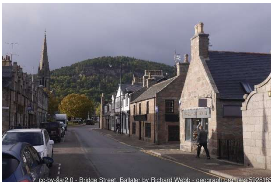
Figure 9 – Bridge Street in Ballater, part of the planned town, containing listed buildings and in the conservation area

However the planned sections of the towns outside these designations are still important to the cultural heritage of the Park and should be safeguarded for the future. Planning applications in planned towns should demonstrate what efforts have been taken to retain the structures and features that contribute to the character of the planned town.