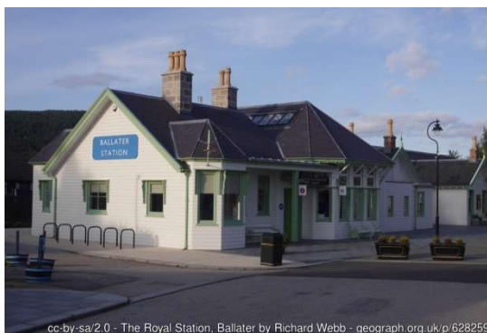
Figure 4 – Ballater old station, partially repaired, re-purposed and replaced after fire

The historic value and setting of the original interest should not be adversely affected. Unsympathetic alterations and unnecessary loss or damage to historic fabric should be avoided.