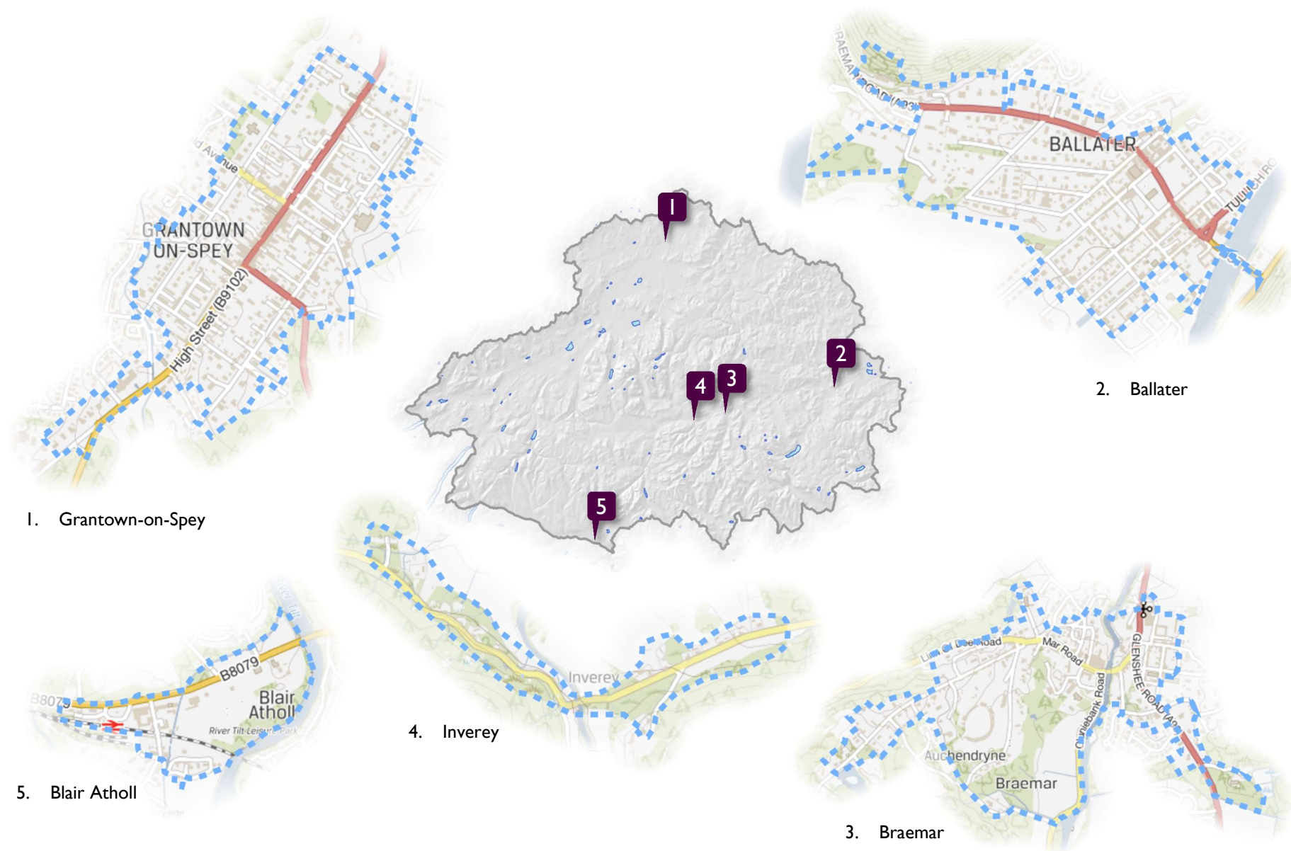
Figure 7 - Conservation areas in the Park. See Local Development Plan for detail.

Contains Ordnance Survey data © Crown copyright and database right 2021.