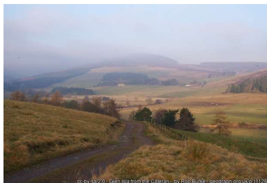
Figure 1 – Cateran trail near Glen Isla in Angus, following ancient tracks & drove roads

landscapes, archaeology as well as features such as wells, veteran trees, traditional meeting places, ancient routes (figure 1) and places mentioned in folk lore.