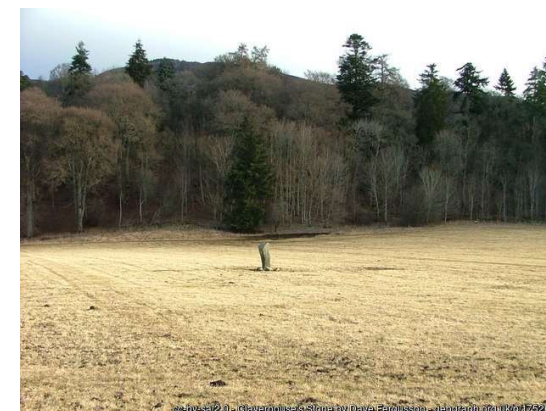
Figure 11 – Claverhouse's stone, a scheduled monument, at the site of the battle of Killiecrankie

Battlefield sites may also be contain or be in proximity to listed buildings or other cultural heritage interests (figure 11). Therefore other consent procedures and considerations will apply where relevant.