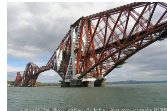
Figure 3 – perhaps the most infamous repair project in Scotland, painting the B listed Forth rail bridge (now done on a ~20 yearly basis)

Repairs and alterations should not normally be disguised or artificially aged, nor should they be obtrusive. Inappropriate materials should not be used to provide a dramatic contrast. The aim should be to retain the visual integrity of the building or structure, while leaving a clear history of the works undertaken in a way that does not confuse the historical record that of the building or structure.