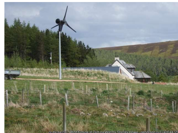
Figure 4 – free standing small scale turbine

unimpeded. Trees and buildings can cause turbulence that can affect the performance, so careful turbine siting is required to ensure it will be viable.