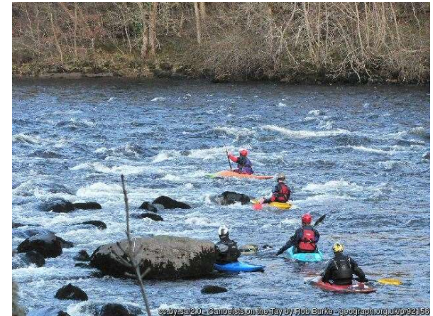
Figure 3 –kayakers on the River Tay

proposed development site, as well as up and downstream effects.