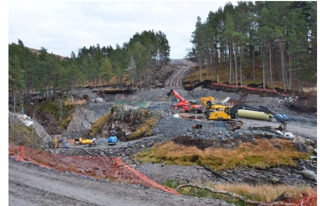
Figure 2 –hydro-electricity construction site

Hydro-electric schemes can involve significant ground excavation during construction, combined with the installation of above and below ground infrastructure such as pipes and tracks (as shown in figure 2). Without careful siting, design, construction and restoration measures, this can result in adverse impacts on landscape, habitats, hydrology and species. A range of assessments should be carried out to inform hydro-electricity proposals so that they can be designed to avoid, minimise or mitigate adverse impacts in accordance with the mitigation hierarchy (figure 1).