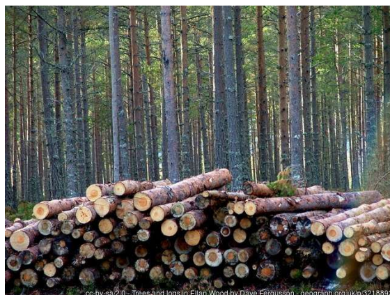
Figure 5 –felled trees at Ellan Wood, Carrbridge

(figure 5) and can demonstrate a long term supply are more likely to be appropriate in the Park. Biomass energy should be located to avoid having adverse effects from/on traffic, noise, odour, water and air quality from energy production, delivery and storage of biomass.