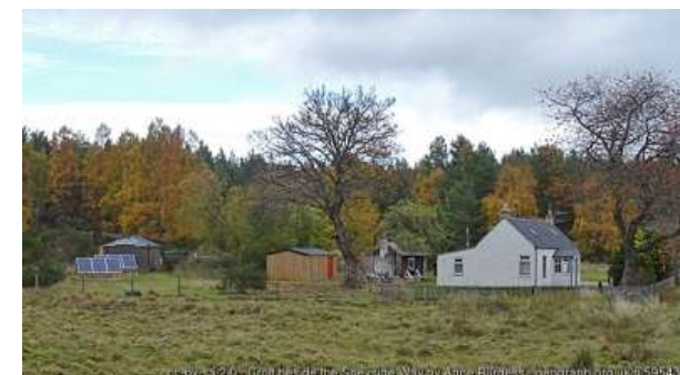
Figure 6 – example of ground mounted domestic scale solar panels (far left)

If mounted on the ground, the potential for effects tends to increase with the scale of the array of panels. For example commercial solar farms will have greater effects due to their size when compared to small domestic scale array (figure 6).