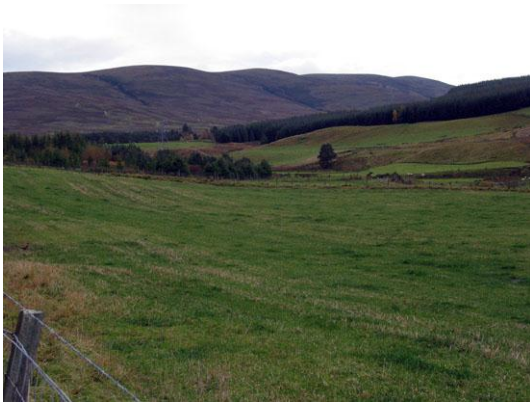
Small fields along the Dalvey Burn, partially enclosed by the conifer woodland extending down from Tom an Uird

The pattern of compact, late 18 th /19 th century farms and their associated relatively small fields along the length of the glen is a consistent and unifying characteristic. The small scale of the glen, fields and farm buildings contrasts with the looming presence of the Hills of Cromdale.