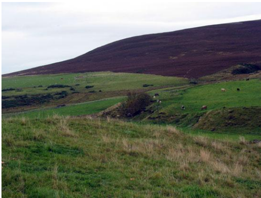
Fields fringe the edge of the moorland along the base of the Hills of Cromdale