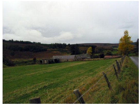
Small farms close to the road