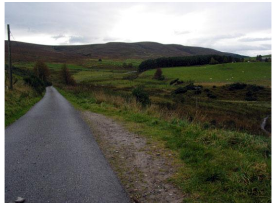
The narrow road sits above the burn, overlooking the small fields