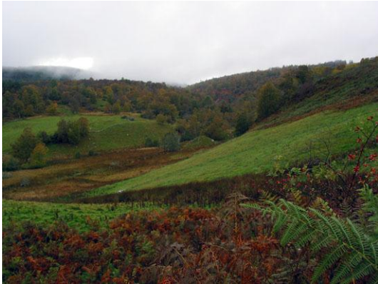
The more complex land form around the narrow gully of the Allt an Fhithich

This is a diverse landscape of complex topography where there is a strong contrast between the elevated upper slopes with their panoramic views and the intimately scaled landform and pattern of fields and woodland reaching down to the steep sided gorge of the Allt an Fhithich. The complexity of this landscape is experienced on the narrow roads which wind between the hummocks and ridges.