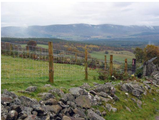
From the upper slopes there are fine views to the south. A fence replaces a dyke in the foreground