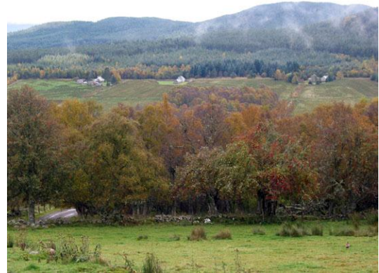
High up farms are located at the brow of the convex slope, above pastures