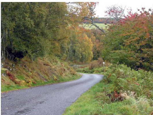
Narrow roads wind through the complex landform