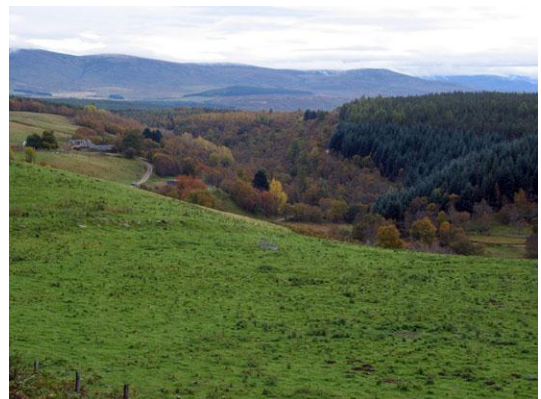
Upper pastures on convex shaped slopes above the wooded river valley