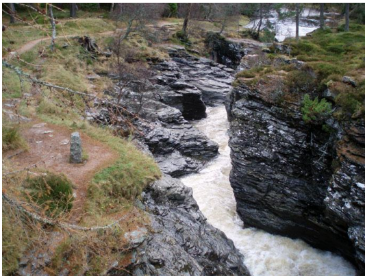
The dramatic deep chasm of the Linn of Dee