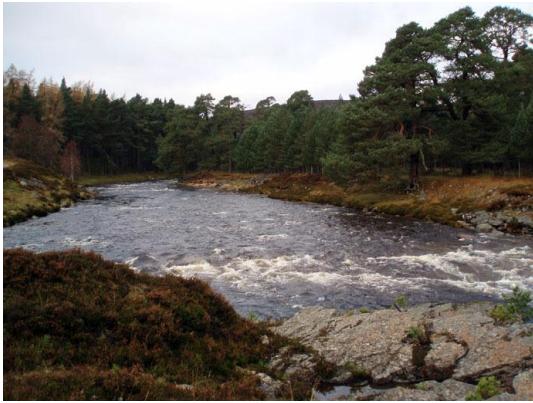
Woodland encloses the narrowing glen of the Dee west of Mar Lodge

The River Dee is a key focus, lying close to the public road, and dramatically funnelled through a rocky gorge. This area lies at the transition between settled Deeside and the more remote uplands and interior glens to the west and north.