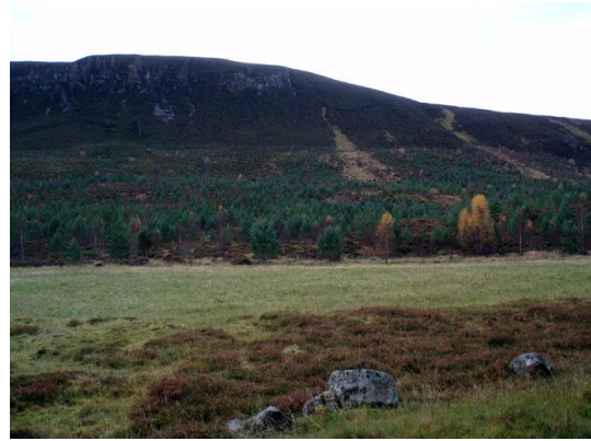
Extensive regeneration of pine on the hill slopes