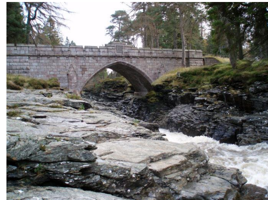
The Gothic style bridge of the Linn of Dee