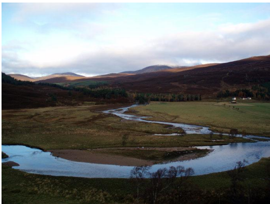
Braided reaches of the River Quoich in the middle of the haugh as it joins the Dee in the foreground