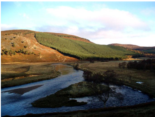
Managed pine woodlands covering the south-facing hill slopes which delimit the haughs

The area is distinctive for the openness, the extensive scale, and the dynamic, semi-natural character of its wetlands, braided reaches of river and pasture and is unlike anywhere else in Upper Deeside.