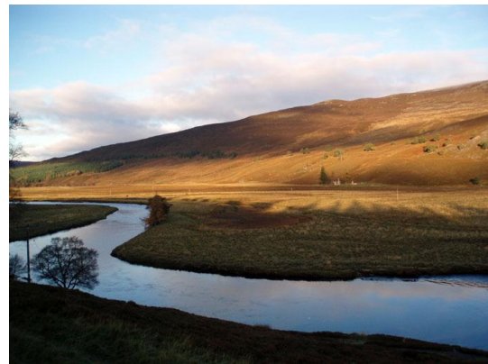
Flat drained pastures and wetlands have an open and expansive character