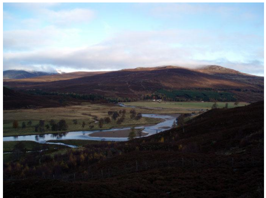
Glimpsed views to Beinn a'Bhuird through Glen Quoich from the public road