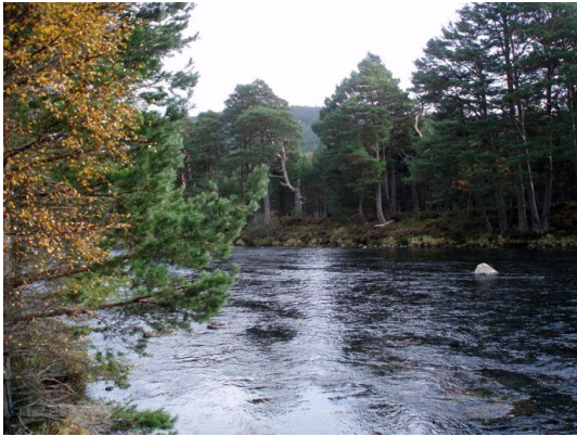
The River Dee runs a straight and even course and is fringed by more naturalistic woodland of mature pine and birch

This is a very simple landscape with few components. The extensive native and well-managed pine woodlands give it a strong sense of order.