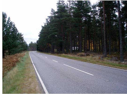
Managed stands of pine lend a distinctive character to the woodlands seen from the A93