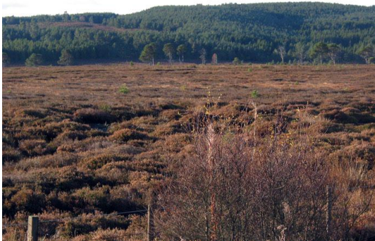
Woodland over the western hills, and some regenerating pine