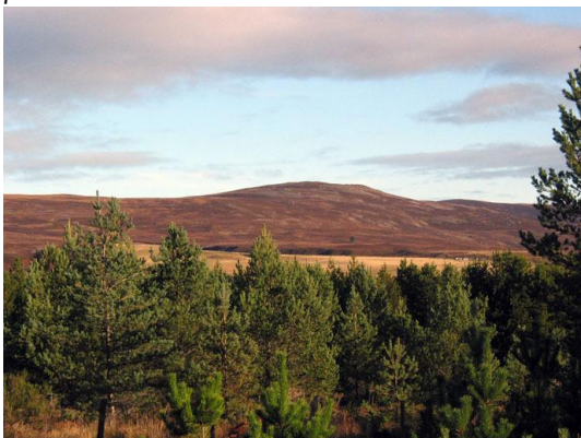
Heather hills to the north and east, with a band of grazing land on the lower slopes