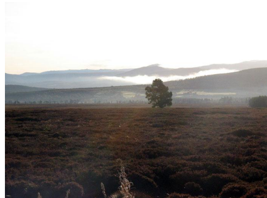
The elevated basin and open moorland offer the opportunity for a dramatic panorama