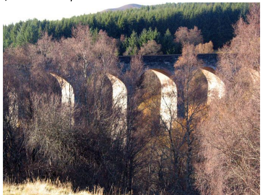
The high arches of the railway bridge over the gorge