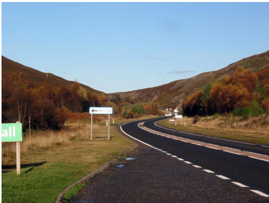
The A9 curves through the Pass above the narrow gorge, its enclosure reinforced by woodland

The contrast between the narrow enclosure in the Pass and the open expanse of the basin creates a dramatic entrance or exit to the Park.