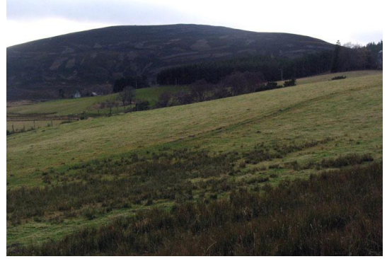
Fields on more gentle slopes, with heather moorland on the upper slopes

The mixture of enclosed fields and rough grazing alternating across the floor of parts of the strath reflects its location as a transition between upland and lowland areas. The strategic placement of Corgarff castle at the conjunction of the strath and the pass to the Lecht within its setting of green fields, combine to create a striking landmark feature.