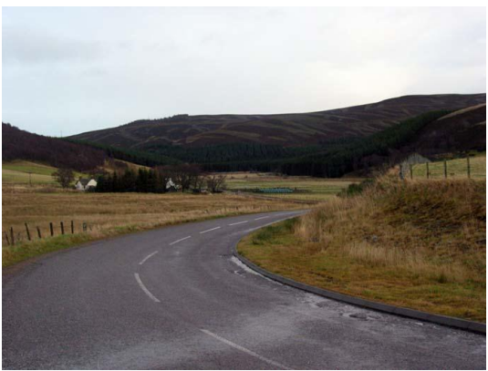
The road sweeps through the undulating land form. The farms are often sheltered by small groups of trees