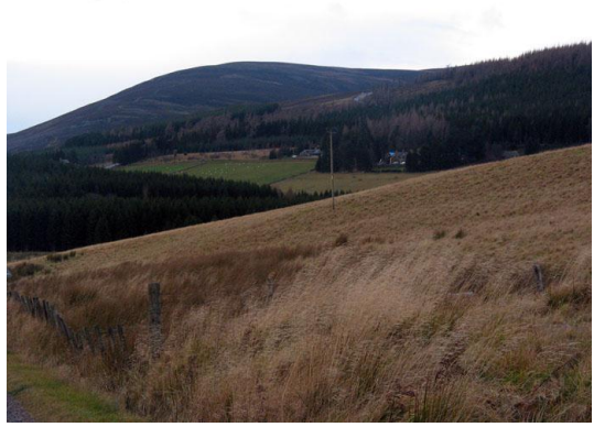
There is more woodland to the west of this character area