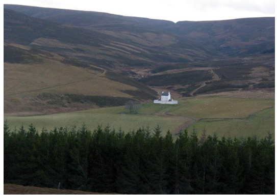
Corgarff castle surrounded by green fields