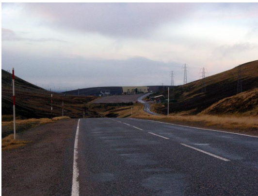
Infrastructure associated with the ski centre, as well as the pylon line, clustered at a high point on the road