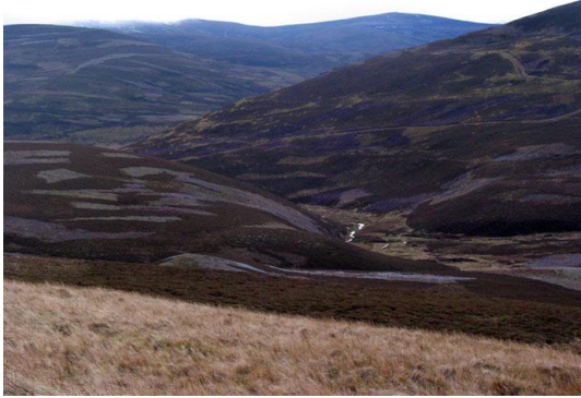
Rounded hills, clad in moor mottled with burnt heather, enclose the deep river valley

The sense of openness, the semi-natural vegetation, the elevation, and the strong 'presence' of the formidable heft of the landform still dominates this upland landscape despite the infrastructure, ski centre buildings and the forestry.