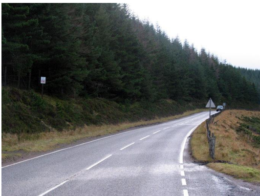
Conifer woodland at the northern end of the pass