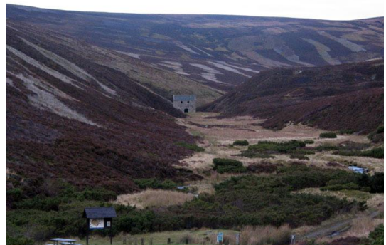
The Well of the Lecht, and the former mid-nineteenth century mine which was the largest manganese mine in Scotland