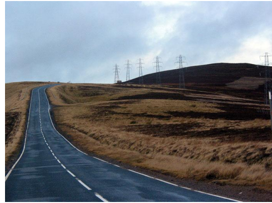
The road sits on the edge of the valley, sometimes on an exposed ridge