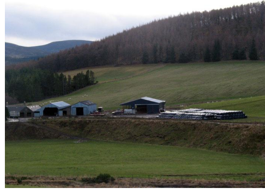
Woodland extends down to the upper edge of the fields, with a farm perched on the river terrace