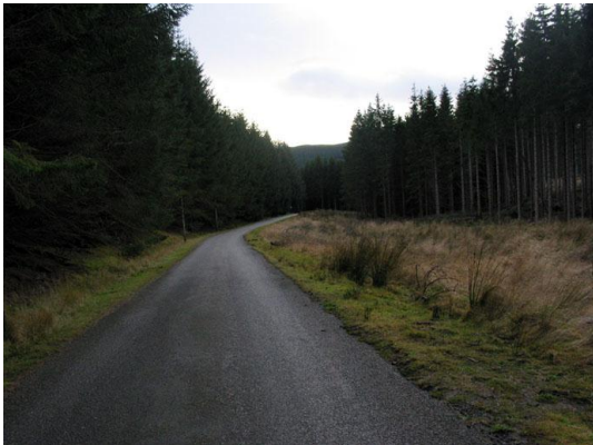
There is extensive conifer woodland in this glen