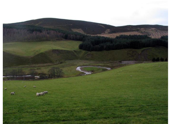
The Water of Nochty meanders through a narrow floodplain contained by dramatic river bluffs. The valley floor has been in filled by glacial deposits and then re-excavated.