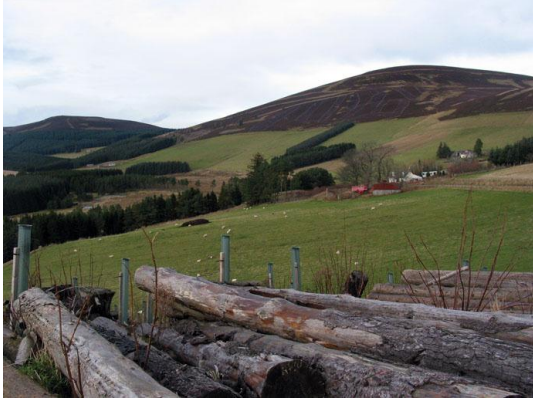
Fields on the west facing slopes, with a farm located on the edge of a side valley

The elevated open views of the dramatic river terraces and the 'motte' are a striking contrast to the more densely wooded stretches of this glen. The consistent location of farms on either river terraces or at the mouths of side glens is a recognisable pattern.