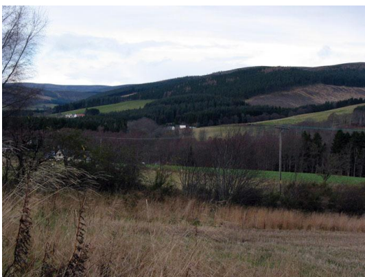
The sequence of woodland and farmland along the glen