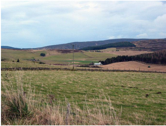
Rolling land form and gentle slopes support fields of grassland and arable land up the side slopes of the strath

Small fields extend high up the smooth, undulating side slopes of the strath, reinforcing the sequence of open farmland alternating with enclosed woodland, some of which is associated with designed landscapes along the strath. Roads are firmly tucked into the winding 'break in slope', so that travelling through this strath reveals its sinuous form.