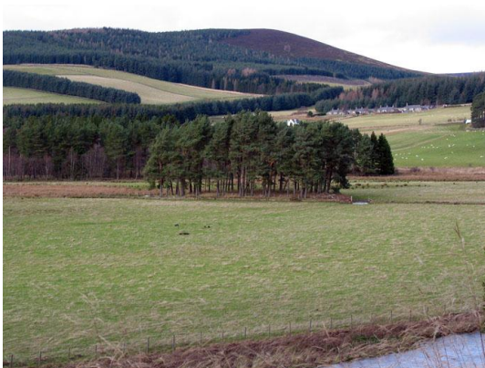
Woodland, including shelterbelts and, on the level floodplain, 'roundels' of pine