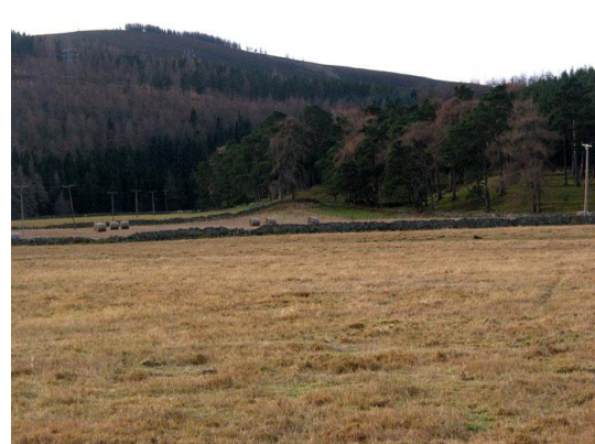
Walls around these fields, and some mature policy woodland