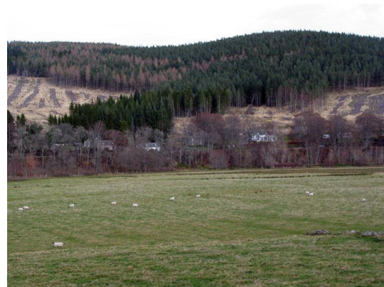
A linear settlement – one of several – adjacent to the River Don, which is hidden within riparian woodland