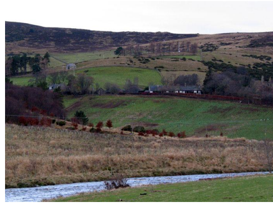
Fields extend up higher slopes, although some are reverting to upland grassland and whin