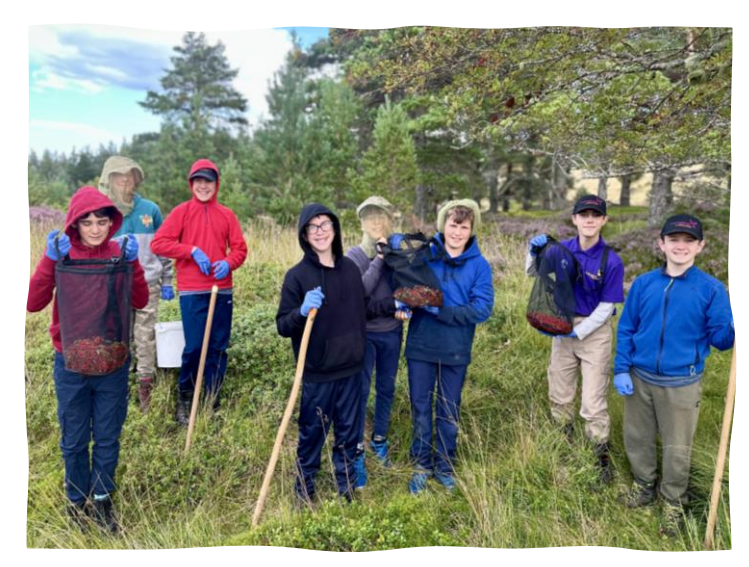
Junior Rangers collecting rowan berries for seed in Abernethy Forest

The Award recognises commitment to rangering and to achieving a variety of relevant competencies, including getting to know and care for your area, helping visitors, interpretation and teamwork