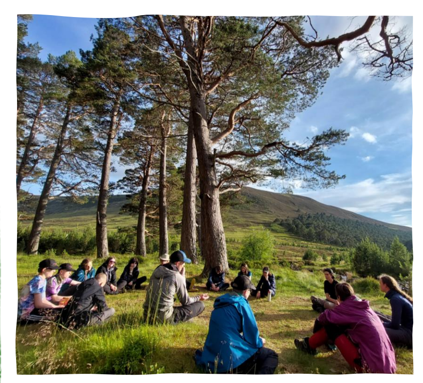
Junior rangers reflecting on day one of the expedition

It's exciting to see our inspiring Junior Rangers being given this national recognition. The Youth Action Award is testament to the hard work and dedication of these young people, who are so passionate about the environment and safeguarding it for the future.