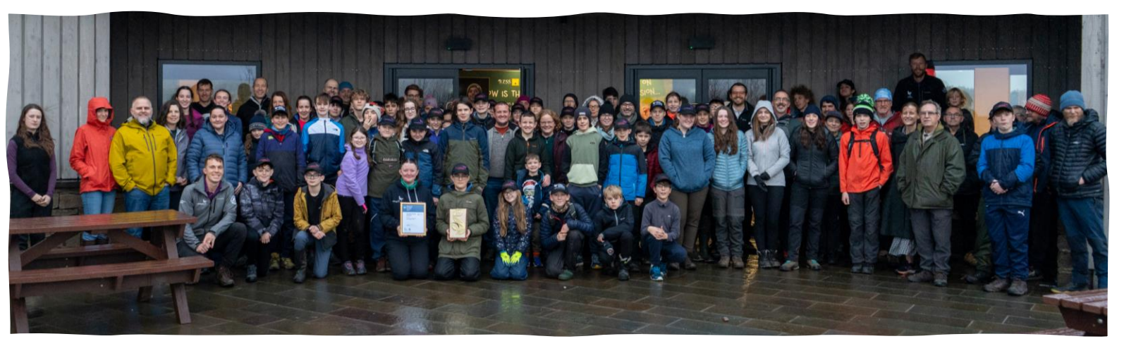
Junior rangers and parents with the Nature of Scotland Award