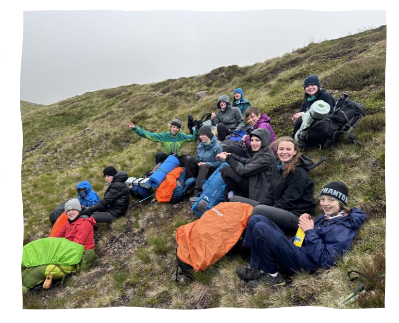
Junior Rangers having lunch on the Cairngorm Plateau