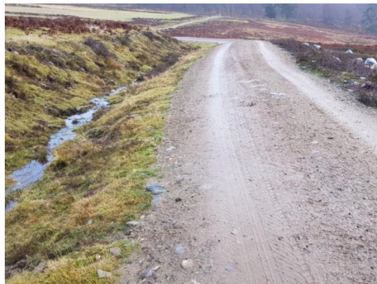
Typical Track Construction Example 2.

Road crossing Culverts may have to be installed at various locations to take draining water away from the uppers side of the tracks. These will be placed at existing surface water crossings to improve and maintain the surface of the track by the use of large diameter piping. Twin walled pipe at either 450 or 600mm diameter with silt trap and splash stone detailing at each ingress and outlet. All carefully uplifted turfs will be laid aside for reinstatement onto bare surfaces to encourage regrowth. Parallel borrow pit drainage crossings will be installed at max 150m centres at locations to suit the existing topography.