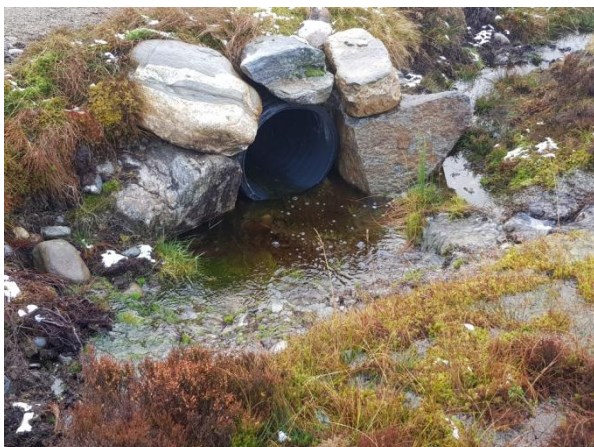
Typical Culvert Inlet

Road crossing Culverts may have to be installed at various locations to take draining water away from the uppers side of the tracks. These will be placed at existing surface water crossings to improve and maintain the surface of the track by the use of large diameter piping. Twin walled pipe at either 450 or 600mm diameter with silt trap and splash stone detailing at each ingress and outlet. All carefully uplifted turfs will be laid aside for reinstatement onto bare surfaces to encourage regrowth. Parallel borrow pit drainage crossings will be installed at max 150m centres at locations to suit the existing topography.