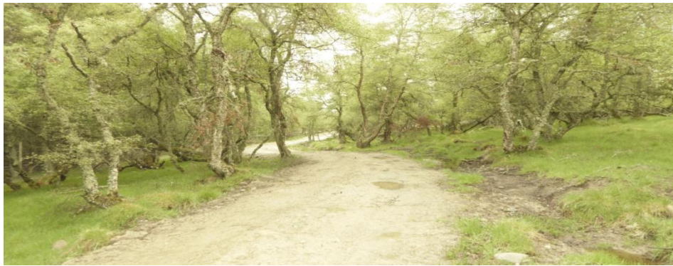
Northern Section of Track B - through woodland

Running south – north from a watercourse south of Glenbeg House to the west of Wester Graggan, where a formal track terminates on the south side of the burn. Track B is approx 650m long with an overall ascent of approx 2m, it then terminates to the north where it meets the boundary of an existing field.