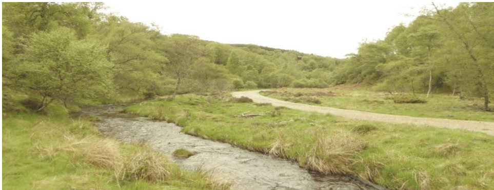
Section of existing Track A – Adjacent to Glenbeg Burn

There are 2no existing natural ford crossings of the burn in the western half of the track with a turning head at the western termination, allowing for articulated timber vehicles to turn freely in a forward gear. Access and egress points to the burn are to be perpendicular to the watercourse where practicable with minimal gradients to the embankments.