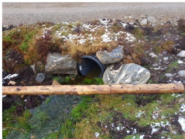
Typical Culvert Outlet