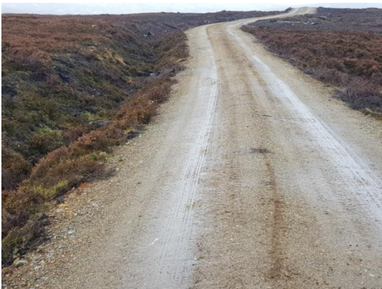
Typical Track construction Example 1.

For the most part of this existing track material will be obtained from 'winning' on site, from shallow borrow pits which run parallel to the upper most side of the track. This method efficiently removes the requirement for hauling large quantities of imported material long distances into the site.