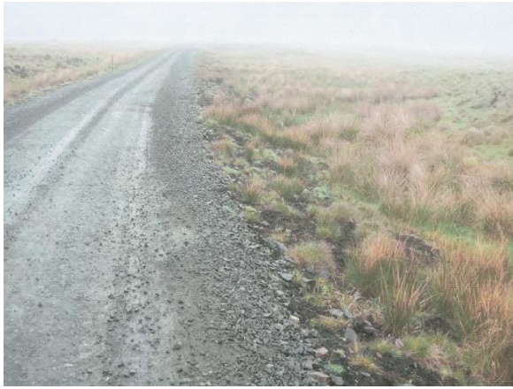
Typical floating road & low verge landscaping example

No works shall take place within the existing burns at the ford crossing, any necessary works to existing embankments shall be worked backwards from the water line. At no point will plant or machinery work from within the watercourses. Silt netting to be installed where necessary to prevent debris entering the watercourse.