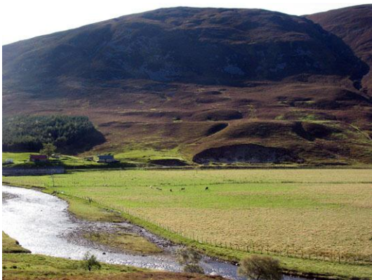
Settlement, largely associated with 18/19 th century farmsteads, is located on the hummocky terrain at the edges of the glen floor