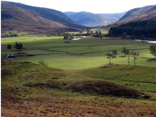
The wide level floor is subdivided into 19 th century improved fields, with only occasional mature trees remaining

The openness of the glen floor allows the pattern of small, but regularly shaped, 19th century improved green fields to dominate, particularly from elevated viewpoints, including the road. Further evidence of past settlement becomes quickly obvious on closer inspection, and appears to inform the location of the 19th century farmsteads, set on elevated hummocks at the edge of the strath.