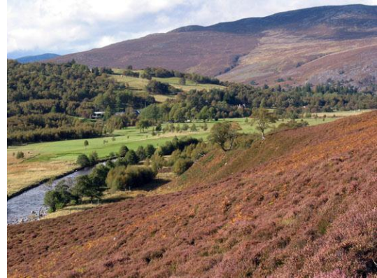
Towards Braemar, a golf course occupies the glen floor, and semi-natural woodland extends across the lower glen sides